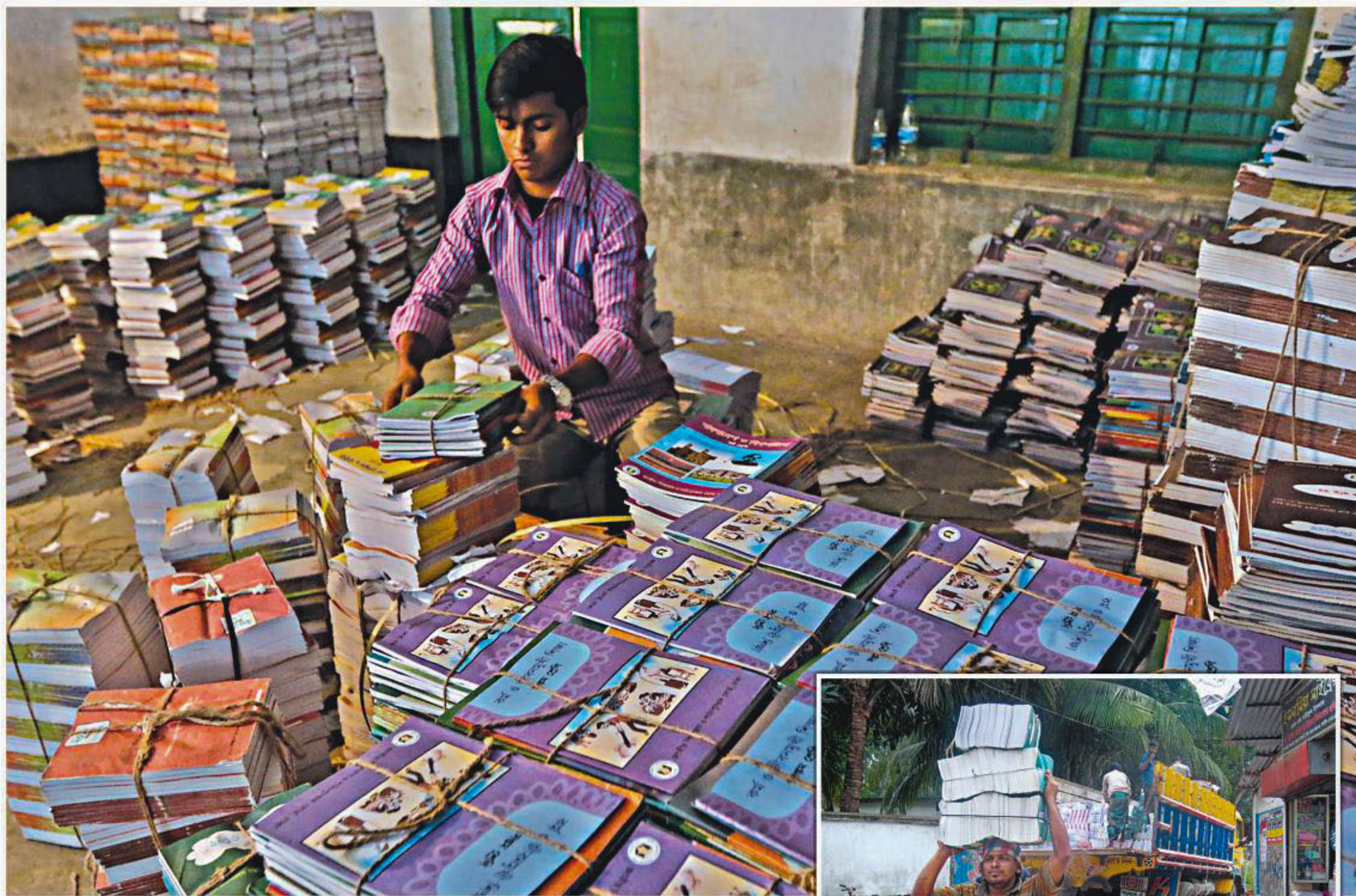
A man sorts textbooks, stored at Chittagong City Municipality Model High School, for dispatch to schools ahead of the new academic year. Inset, workers unload a truck full of textbooks at Rajapur Pilot High School in Jhalakathi.