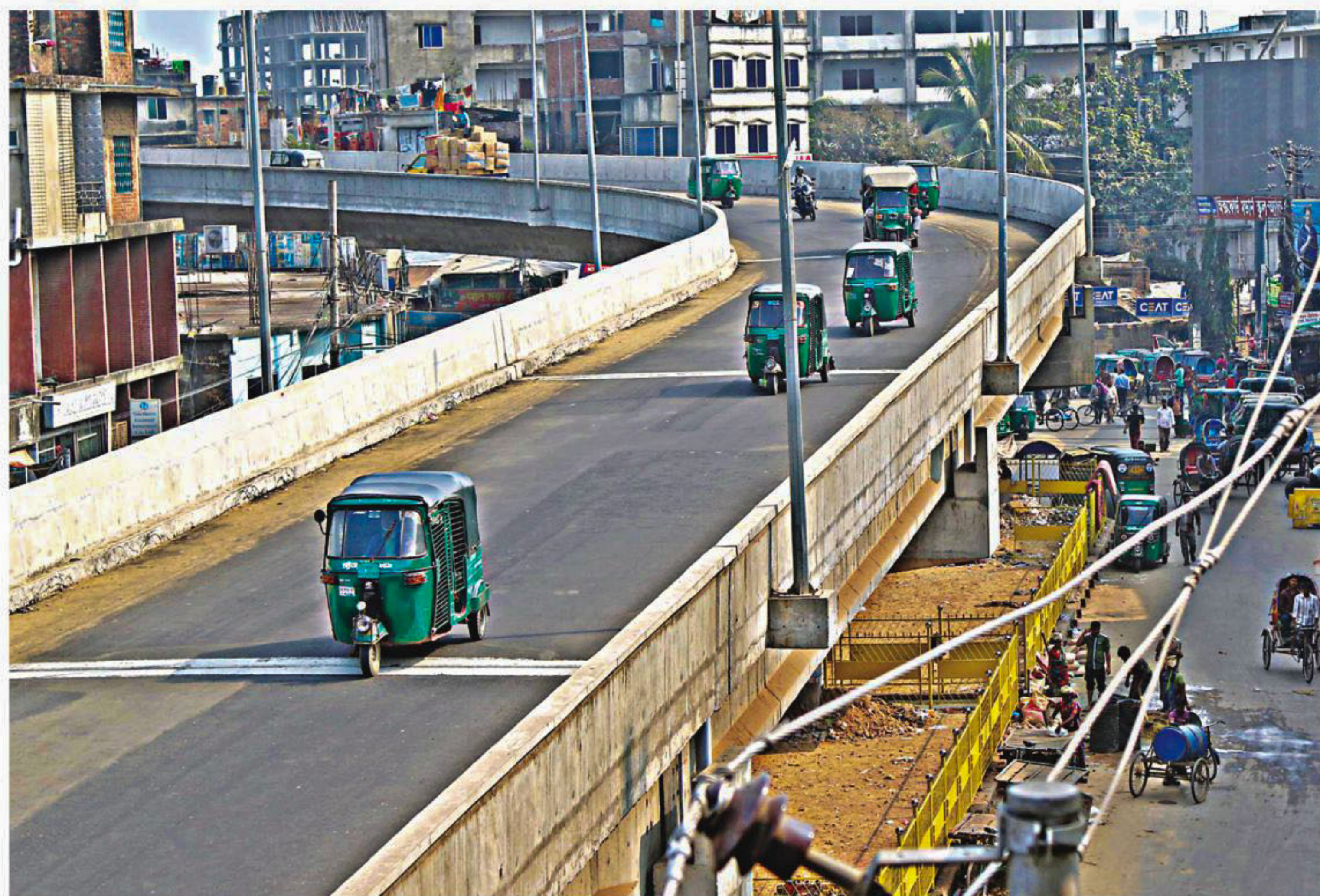
The 1.1km Kadamtali flyover was opened to the public yesterday on a test basis after its construction was completed a few days ago. The flyover, which will be inaugurated by Prime Minister Sheikh Hasina, is expected to ease traffic congestion in the port city and reduce pressure on Dewanhat bridge nearby. The photo was taken yesterday.