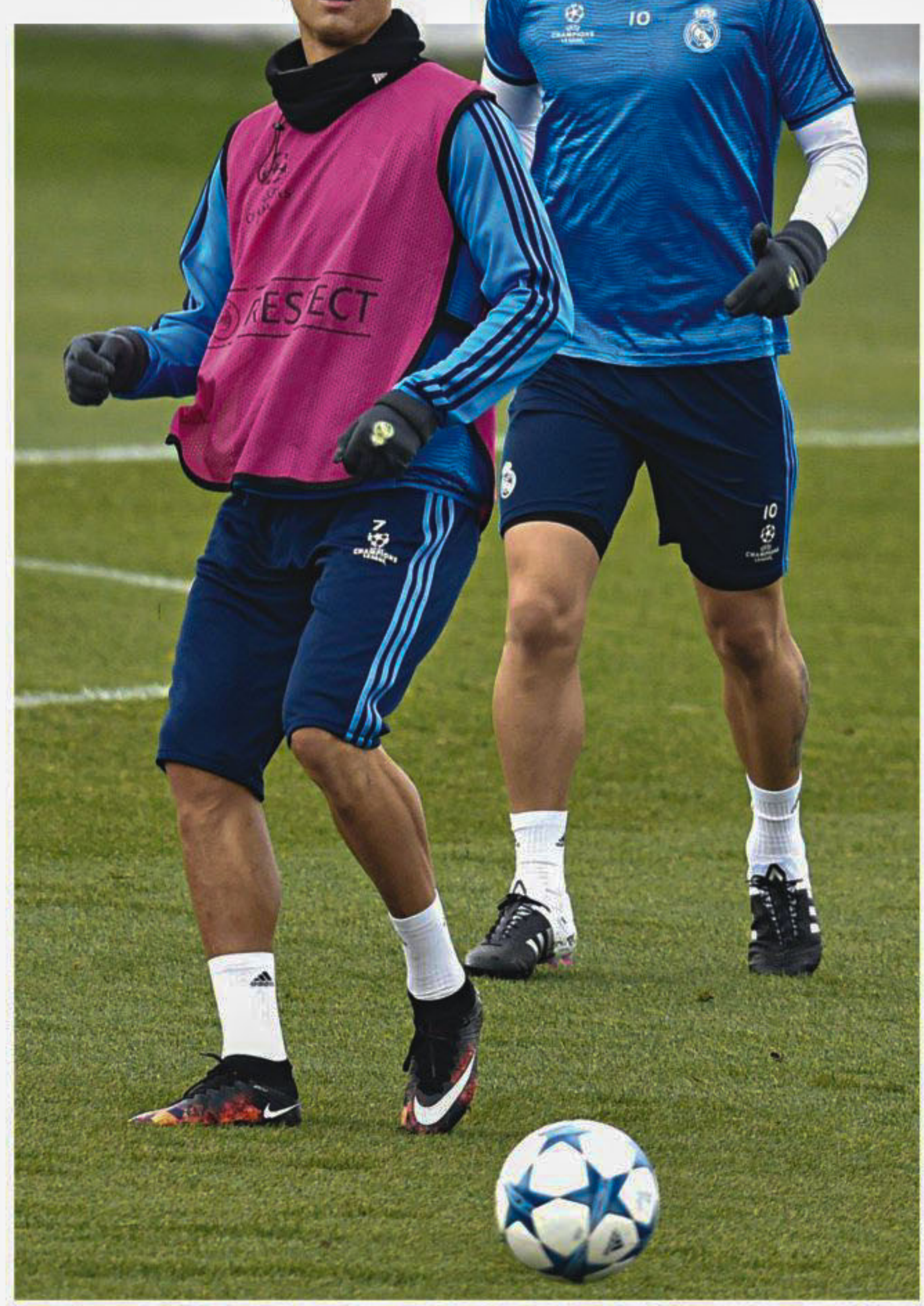
Real Madrid stars Cristiano Ronaldo (L) and James Rodriguez take part in a training session at the Valdebebas training ground yesterday ahead of tonight's Champions League fixture against Malmo.

Benitez to rest stars AFP, Madrid Real Madrid coach Rafael Benitez admitted he will rotate his squad for the visit of Swedish champions Malmo on Tuesday with Madrid already assured of their place in the last 16 of the Champions League. Madrid's better head-to-head record against Paris Saint-Germain means the 10-time winners will finish on top of Group A no matter what happens on matchday six. And with a crucial league clash away to Villarreal to come on Sunday, Benitez hinted that the likes of Cristiano Ronaldo, Gareth Bale and Karim Benzema could be set for a rest. "It is a day to rotate, albeit still with the idea of winning," Benitez said on Monday. "We are very satisfied to have qualified as group winners, but we want to keep on winning and manage both things. The possibility to win and to change some players so that everyone is in the best condition possible for the game against Villarreal." BFF's EC meeting postponed SPORTS REPORTER