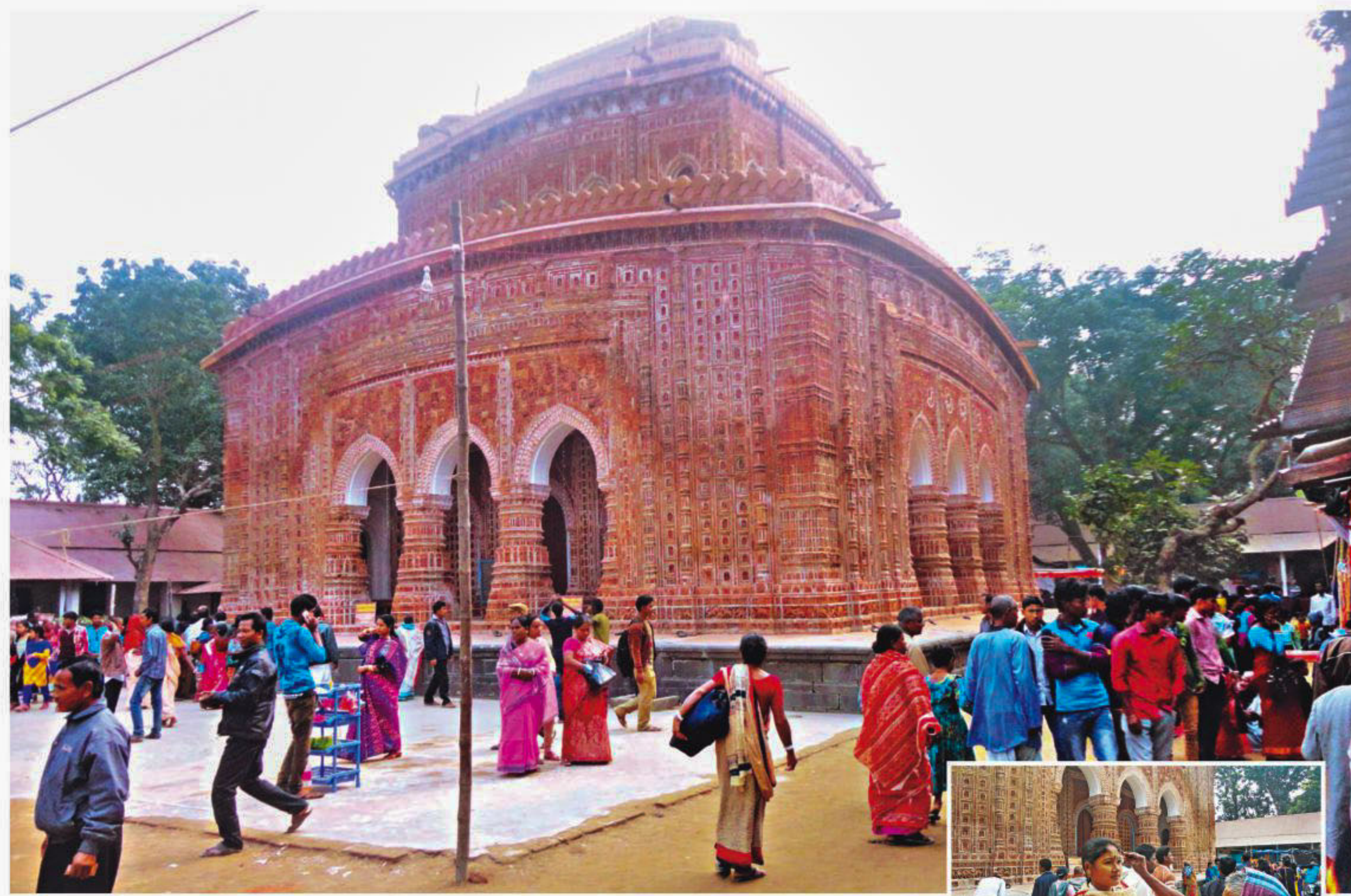
The turnout at the Raaspujima Mela of Kantaji temple in Dinajpur is lower than usual following Saturday's blast that left six people wounded there. Inset, a devotee putting a sandalwood tilak on another's forehead.