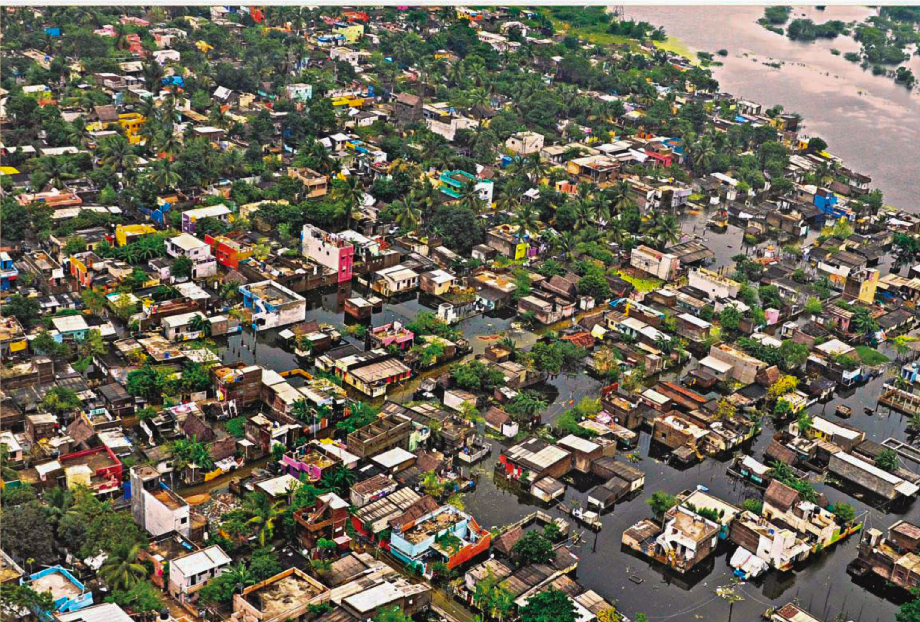
An aerial view from a relief helicopter shows flood-hit areas of India's Chennai on Saturday. Nearly 300 people have died in the disaster since November 9. Yesterday, the airport in the city reopened following a four-day closure as the floodwater receded there.