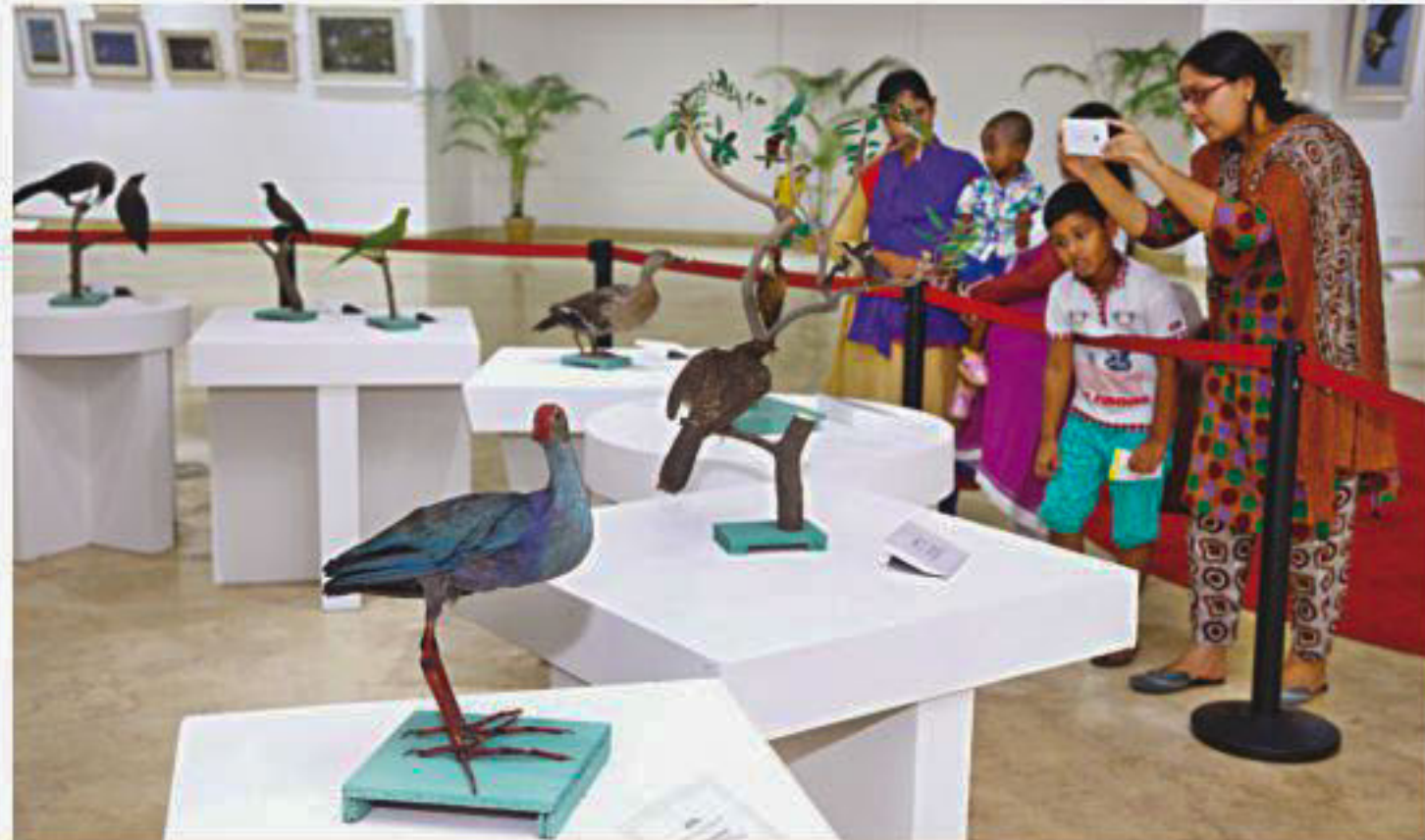
Visitors at the exhibition.

The actor was honoured with the Lifetime Achievement at the National Film Awards 2012. His unique voice, square jaw and cold gaze will remain etched on the minds of film lovers and serve as a perennial source of inspiration for the generations of actors to come.