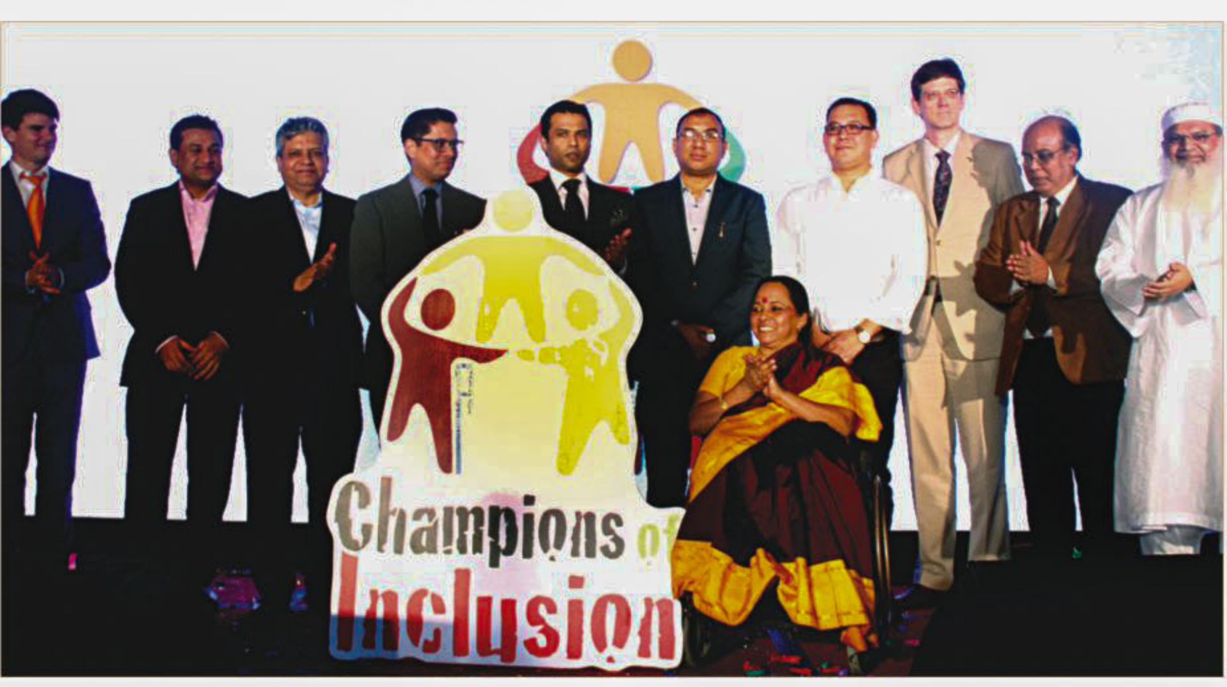
Guests at an event to inaugurate "Champions of Inclusion" (a platform of RMG factory owners of Bangladesh to promote the inclusion of persons with disabilities in the mainstream workforce). The event was organised by Inclusive Skills Development (ISD), a component of the Deutsche Gesellschaft für Internationale Zusammenarbeit (GIZ) on Wednesday.