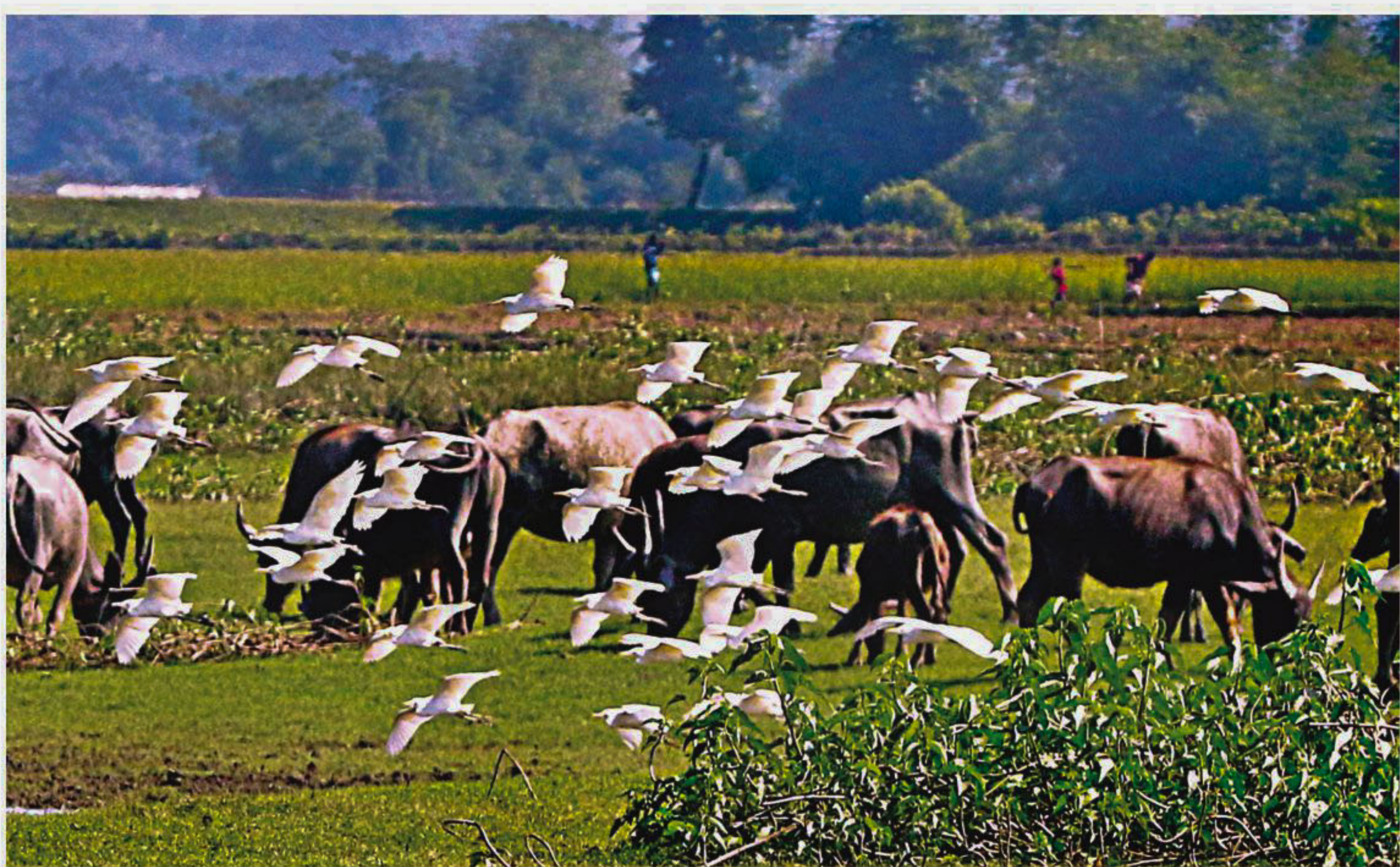
Cattle egrets circle a herd of water buffalo in Sylhet's Gowainghat recently, intending to feast on insects and worms stirred up by the grazers on wetlands where waters have receded with the approach of winter.