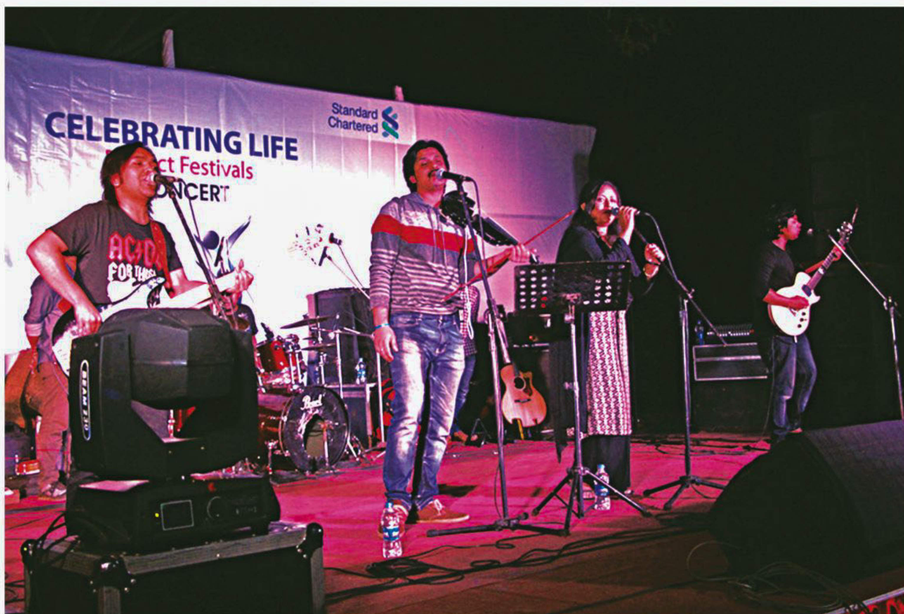
Artistes performing at the Celebrating Life programme jointly organised by The Daily Star and Standard Chartered Bank at the basketball ground of Shahjalal University of Science and Technology in Sylhet yesterday.