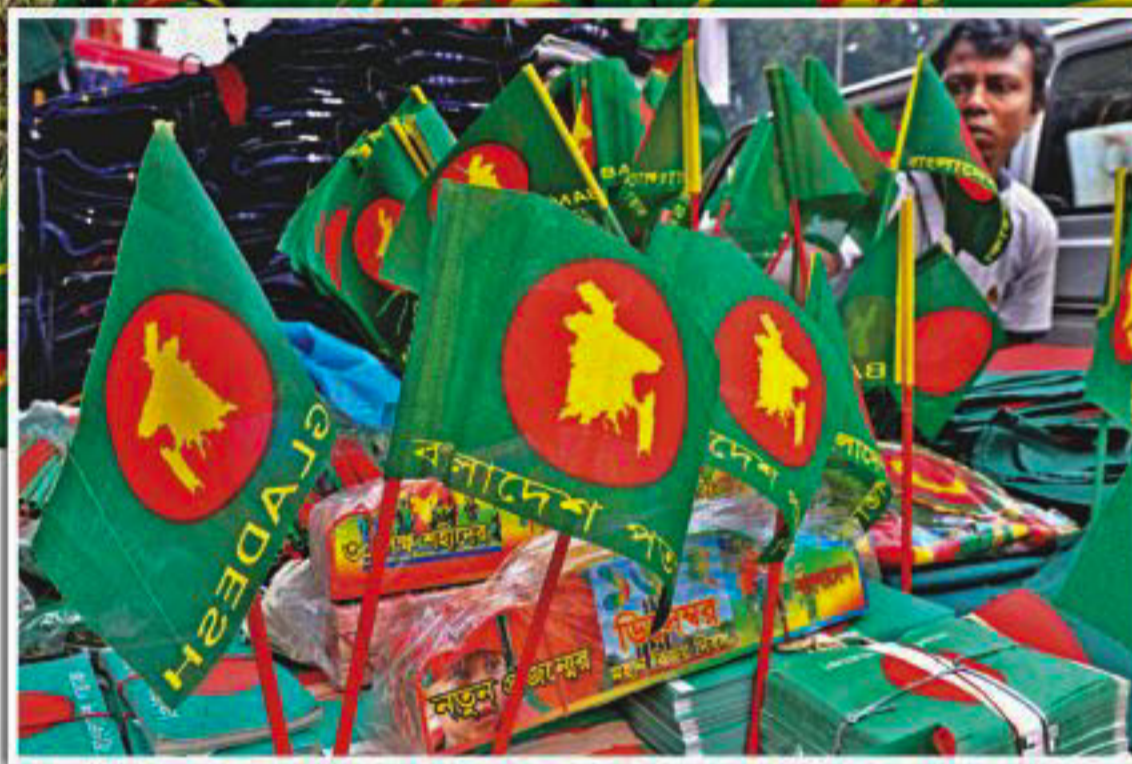
A large cloth printed with the national flag (as it was in 1971) is being taken for drying at Roopganj in Narayanganj. The cloth is later cut into small pieces and sold in the market, inset. Every year in December, the month of victory, sales of this flag skyrocket as many people hoist it at their homes, offices and their vehicles to uphold the spirit of the Liberation War.