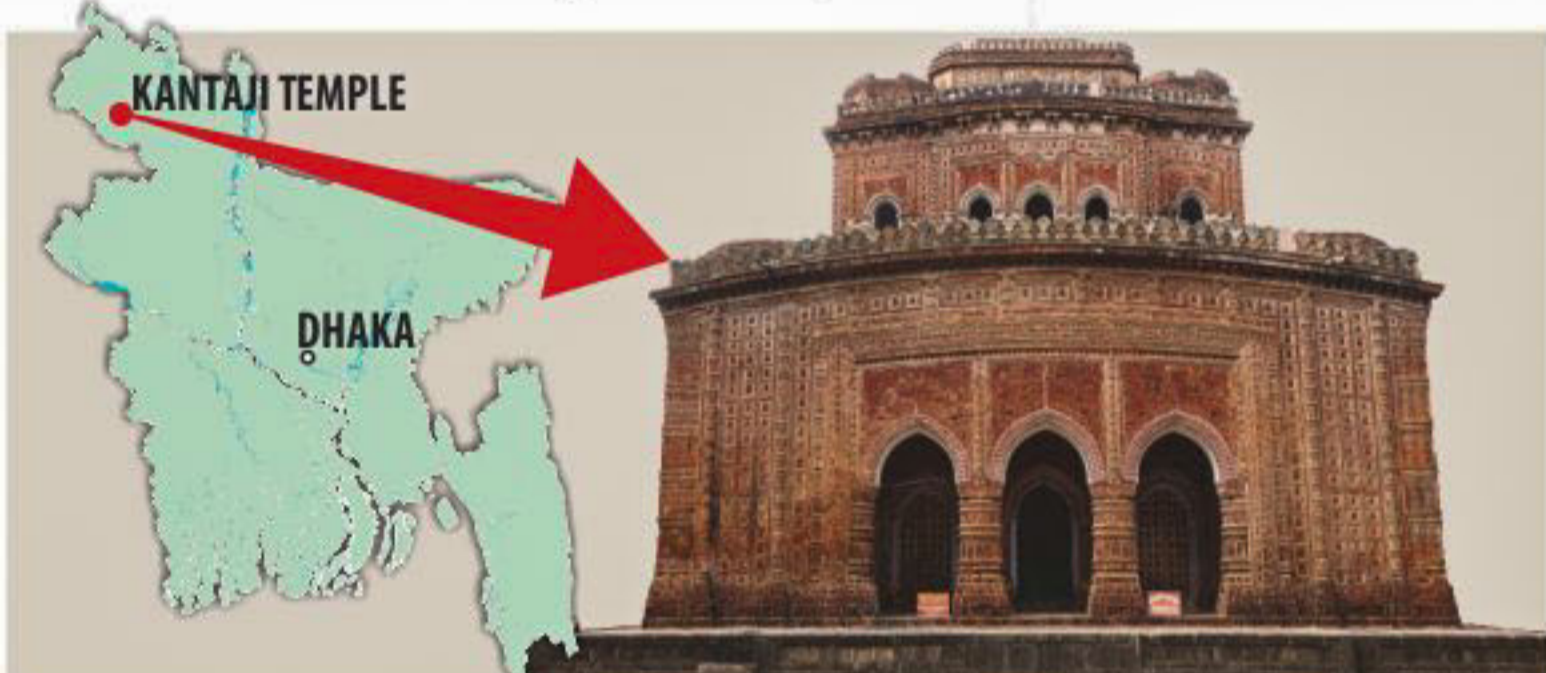
QUAMRUL ISLAM RUBAIYAT, from Dinajpur

At least six people were injured in an explosion next to the 18th century Kantaji Mandir of Dinajpur early yesterday when spectators were watching jatra (folk theatre).