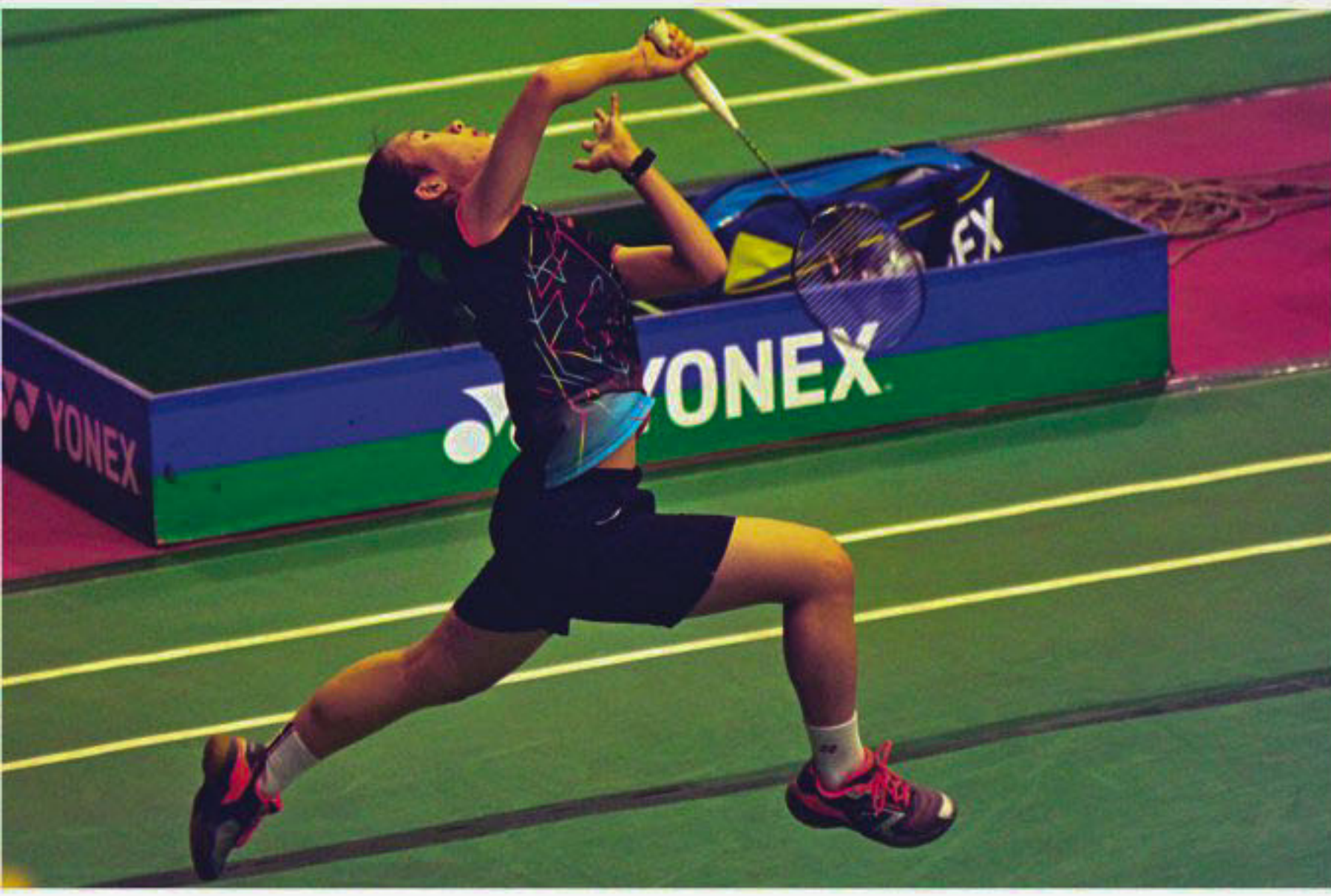
Top-seed Iris Wang of the United States executes a smash during her quarterfinal rubber of the Yonex-Sunrise Bangladesh Open International Challenge at the Shaheed Tajuddin Ahmed Indoor Stadium in Paltan yesterday.

With all these elements present, the game should make for an interesting final although both teams have already secured passage to the ICC Women's World Twenty20.