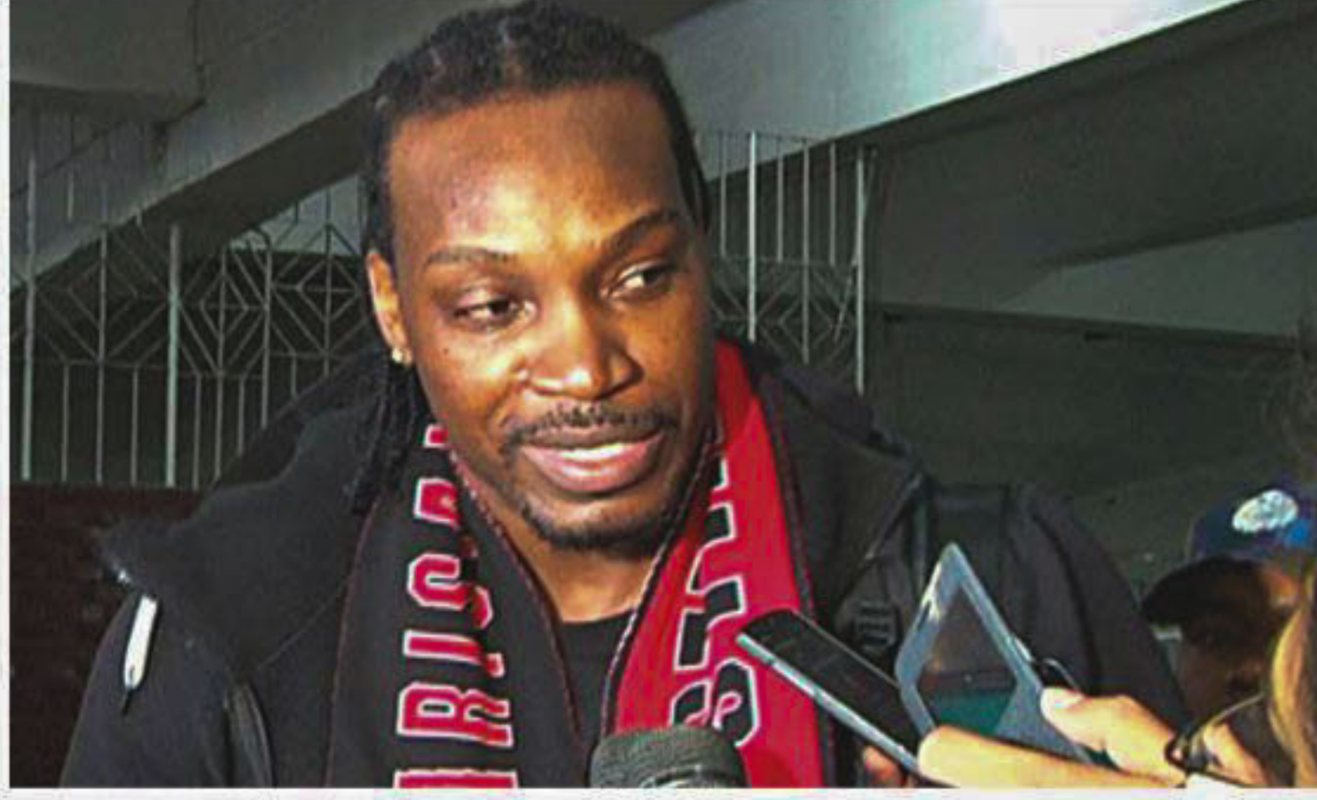
Chris Gayle arrived in Dhaka last night sporting Barisal Bulls merchandise as he looks to add further firepower to the team.

When asked if he had any message for his fans in Bangladesh, the left-hander broke into a smile and said: "Well I am here. Bangladesh, I am here. I am in town see you on the sixth. Let's have some fun at the stadium all