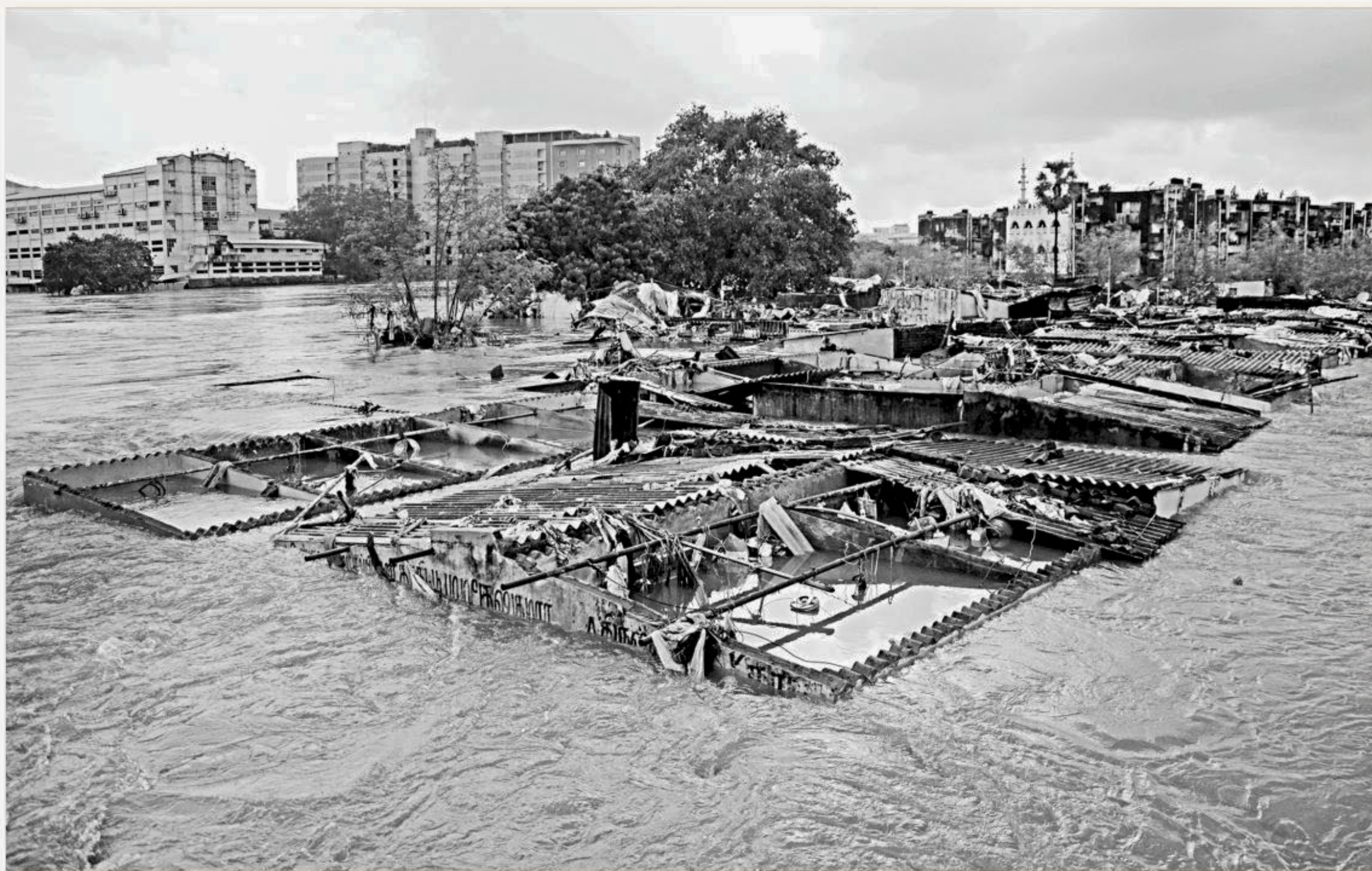
This general view shows buildings inundated by floodwaters in Chennai yesterday. Thousands of rescuers raced to evacuate residents from deadly flooding yesterday...