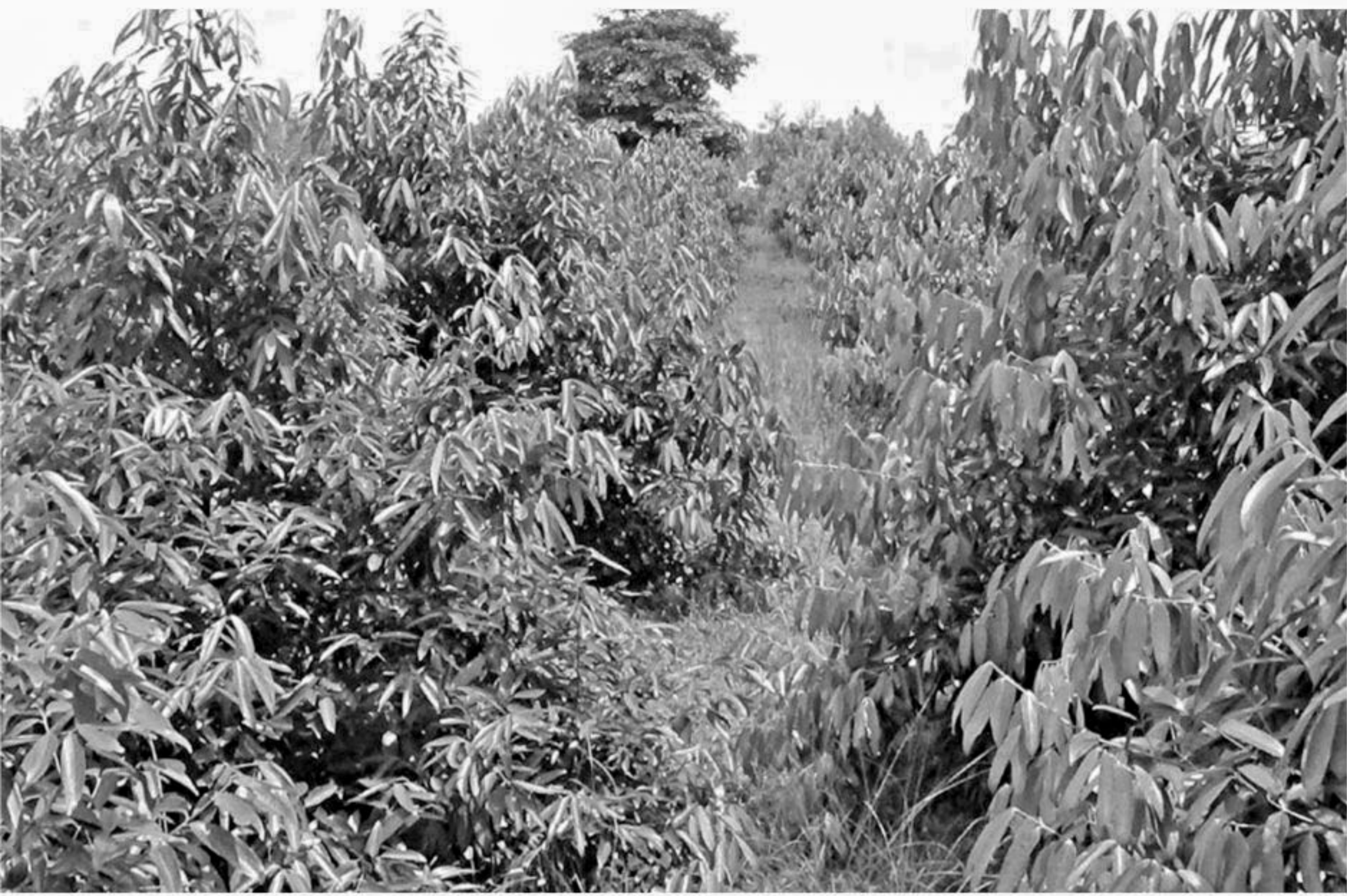
A cassia leaf plantation at Phultala village in Panchagarh Sadar upazila.