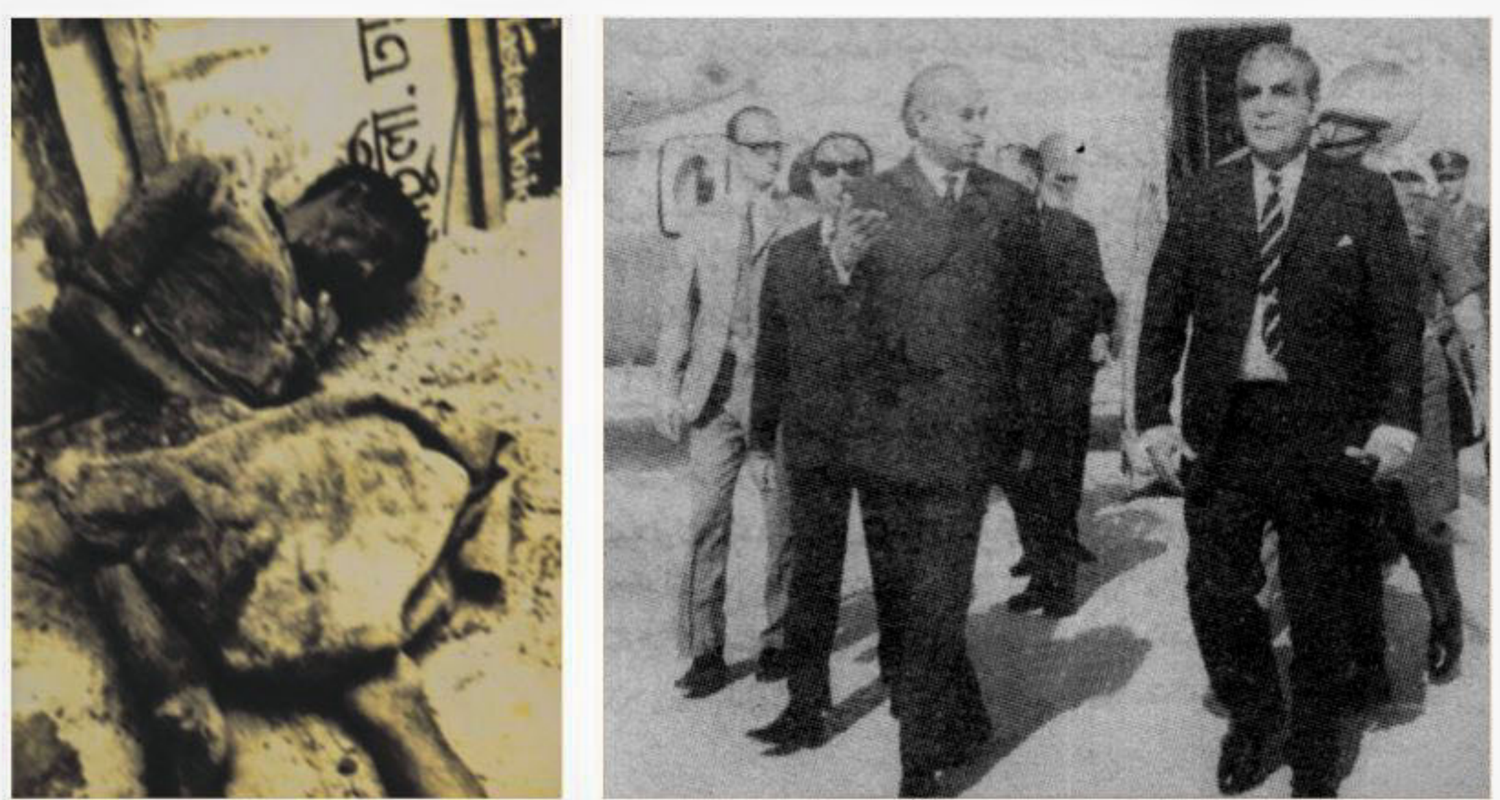
Then Pakistan Peoples Party chief Zulfikar Ali Bhutto receives president Yahya Khan at Moenjodaro Airport in Sindh, hometown of Bhutto, in January 1971. Left, a victim of the genocide committed on the night of March 25, 1971.