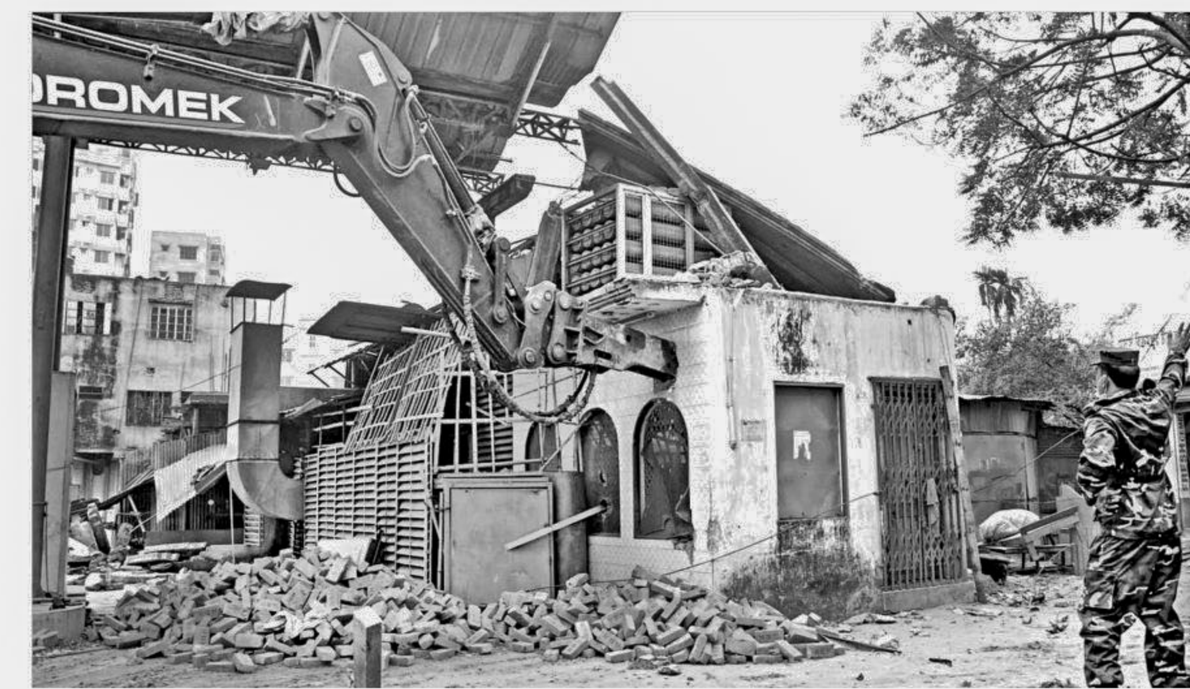
Rajdhani Unnayan Karttripakkha (Rajuk) demolishes illegal structures in Merul Badda of the capital yesterday to recover four acres of public land, which will be used in construction of a U-turn as a part of the Hatirjheel development scheme.