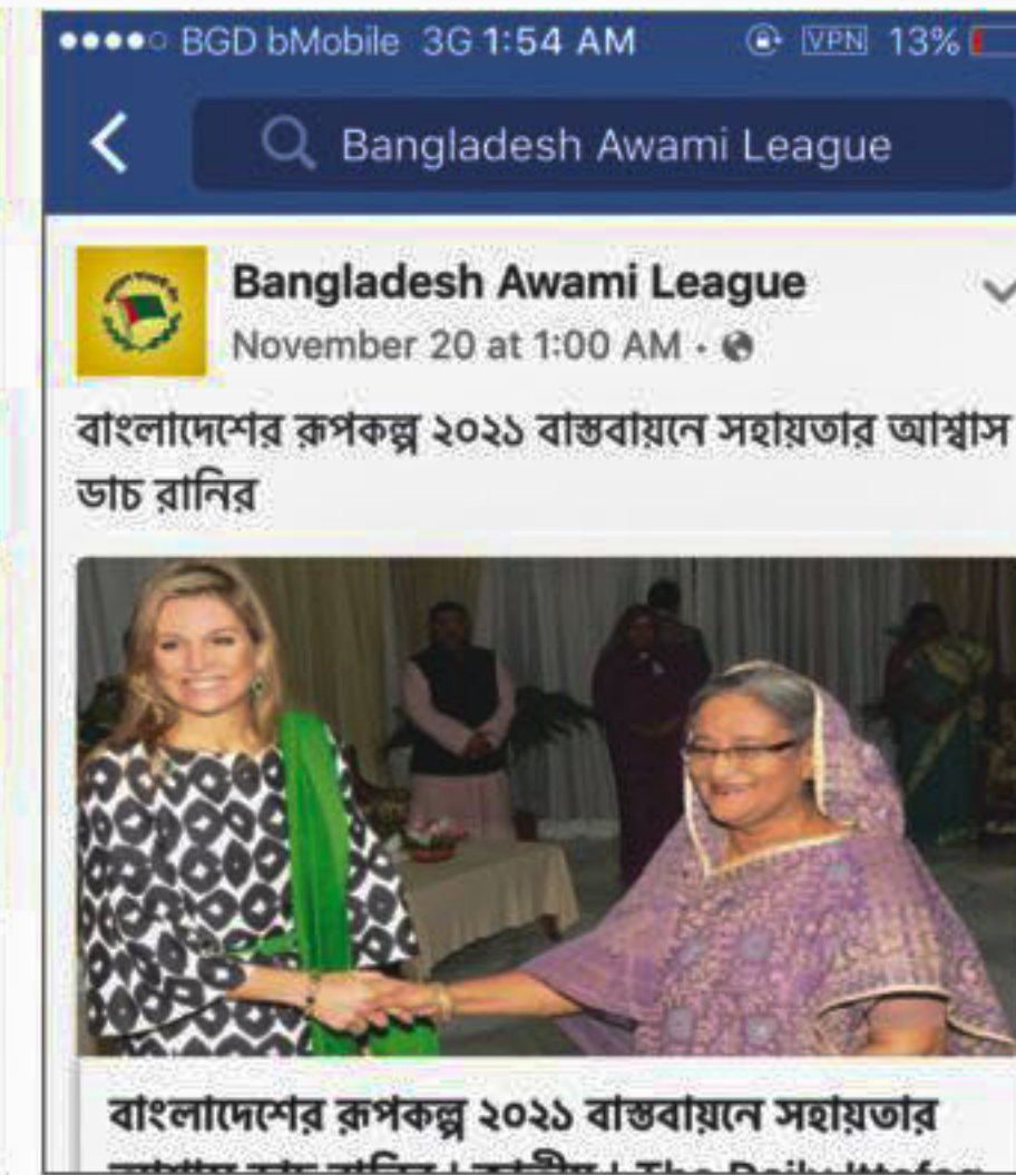
Screenshots of Facebook posts by, clockwise from top left, the press wing of the Prime Minister's Office, Gazipur-2 MP Zahid Ahsan Russel, the VAT Intelligence, the ruling Awami League, State Minister for ICT Division Zunaid Ahmed Palak and Bangladesh Cricket Board. These posts were made after November 18, the day the government blocked access to the social networking site on 'security' grounds.