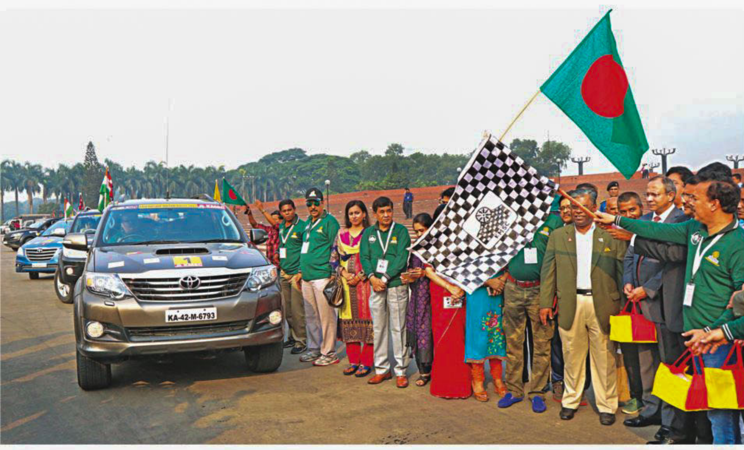
Road Transport Minister Obaidul Quader flags off the final leg of a friendship motor rally of Bangladesh, Bhutan, India and Nepal in front of the Jatiya Sangshad yesterday before its departure. The rally, which ended in Kolkata, was launched following a deal aimed at starting seamless transit of passenger, cargo, and personal vehicles between the four countries.