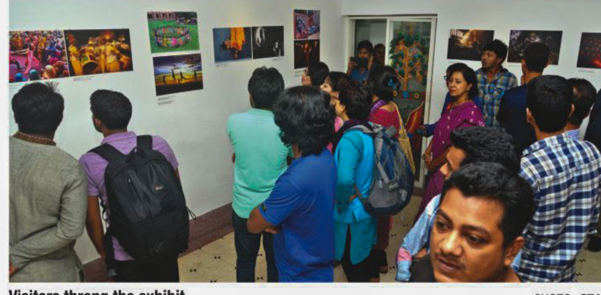
Visitors through the exhibit.