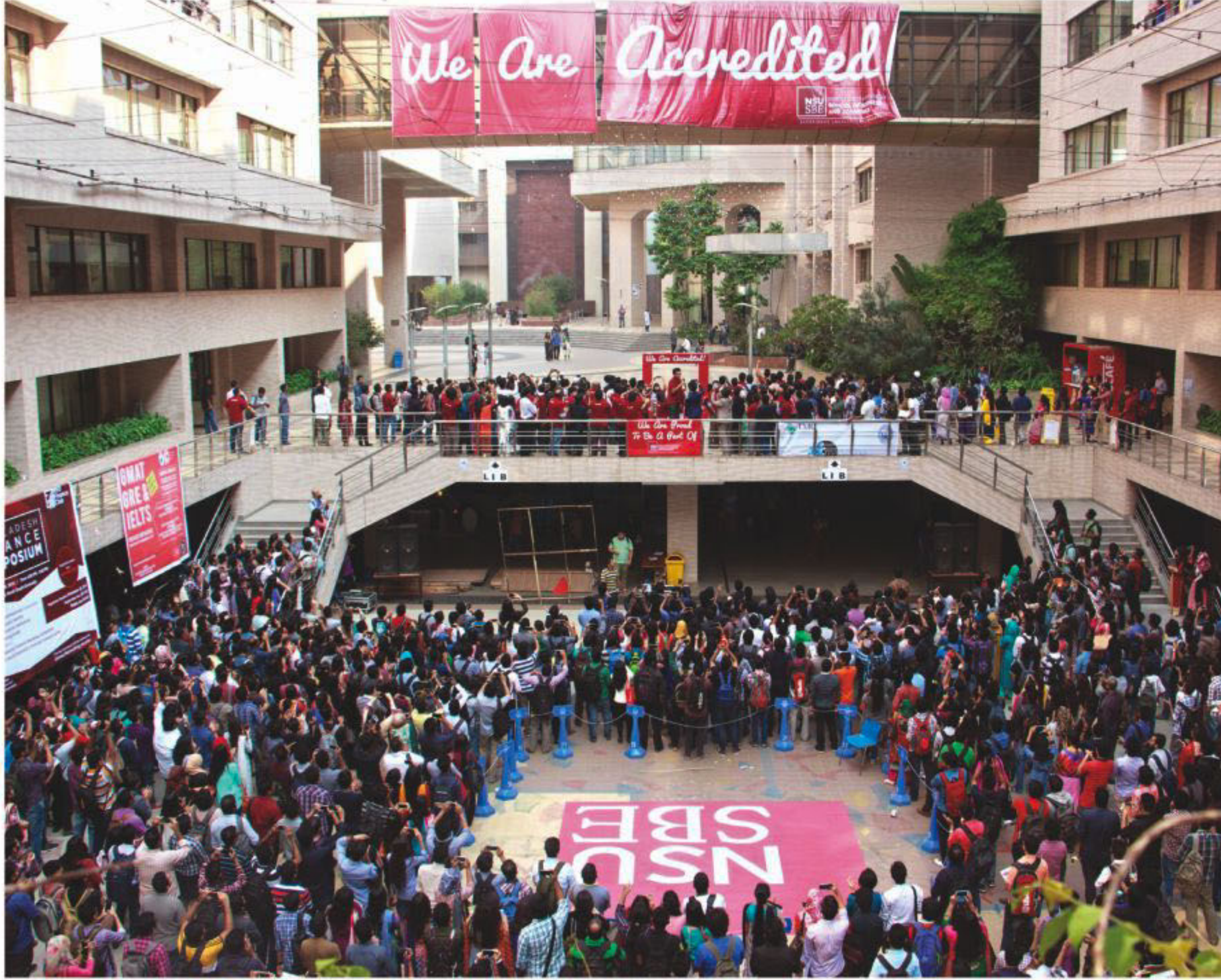
"We Are Accredited" On Saturday, November 29, 2015, NSU SBE formally announced that it has acquired ACBSP accreditation, the very first university to get American accreditation in Bangladesh.