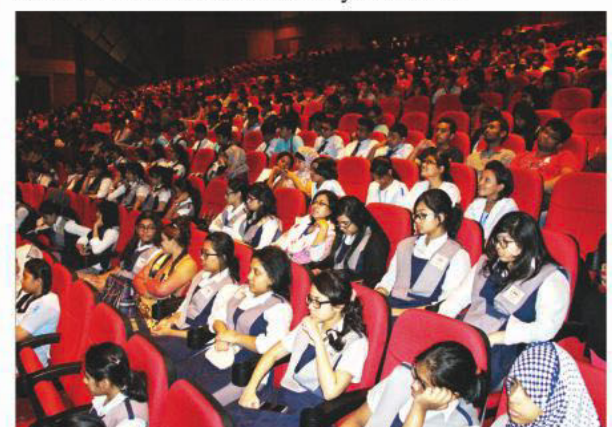
The audience enjoying the session.