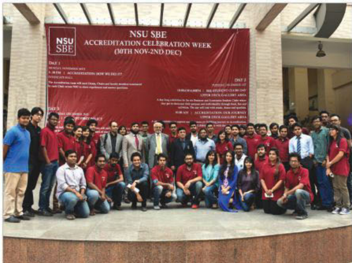
The Chairman, along with other faculty members, takes part in the SBE student celebration at NSU.

North South University's School of Business and Economics (SBE) made history by becoming the first business school in Bangladesh to receive specialized American accreditation. SBE received accreditation from the Accreditation Council for Business Schools and Programs (ACBSP), USA, and was rewarded for its continuous improvement efforts over the past eighteen months.