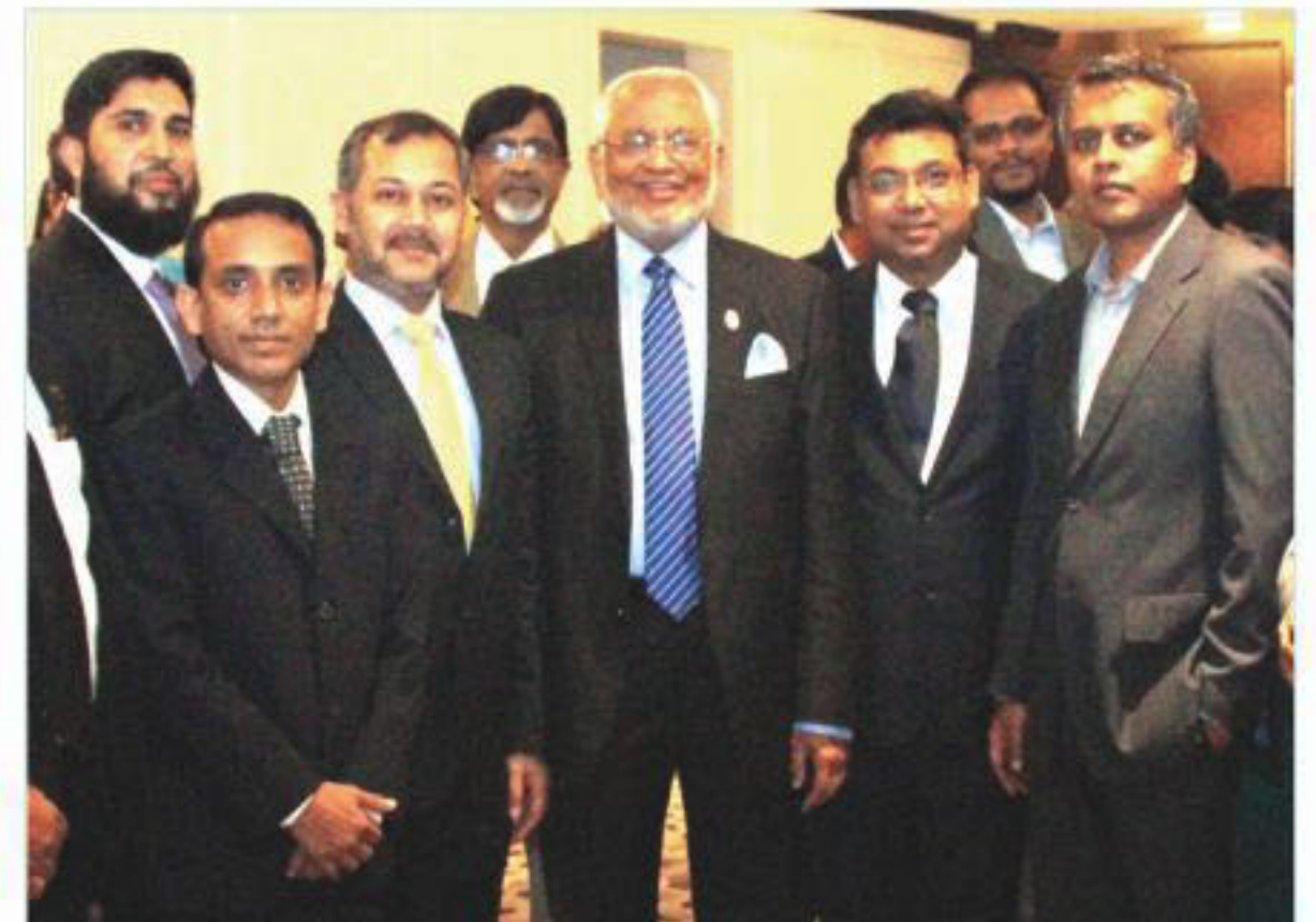
NSU SBE alumni, many of whom are leading in industry as entrepreneurs, CEOs, investment bankers, consultants, academics, performance artists, and industrialists.