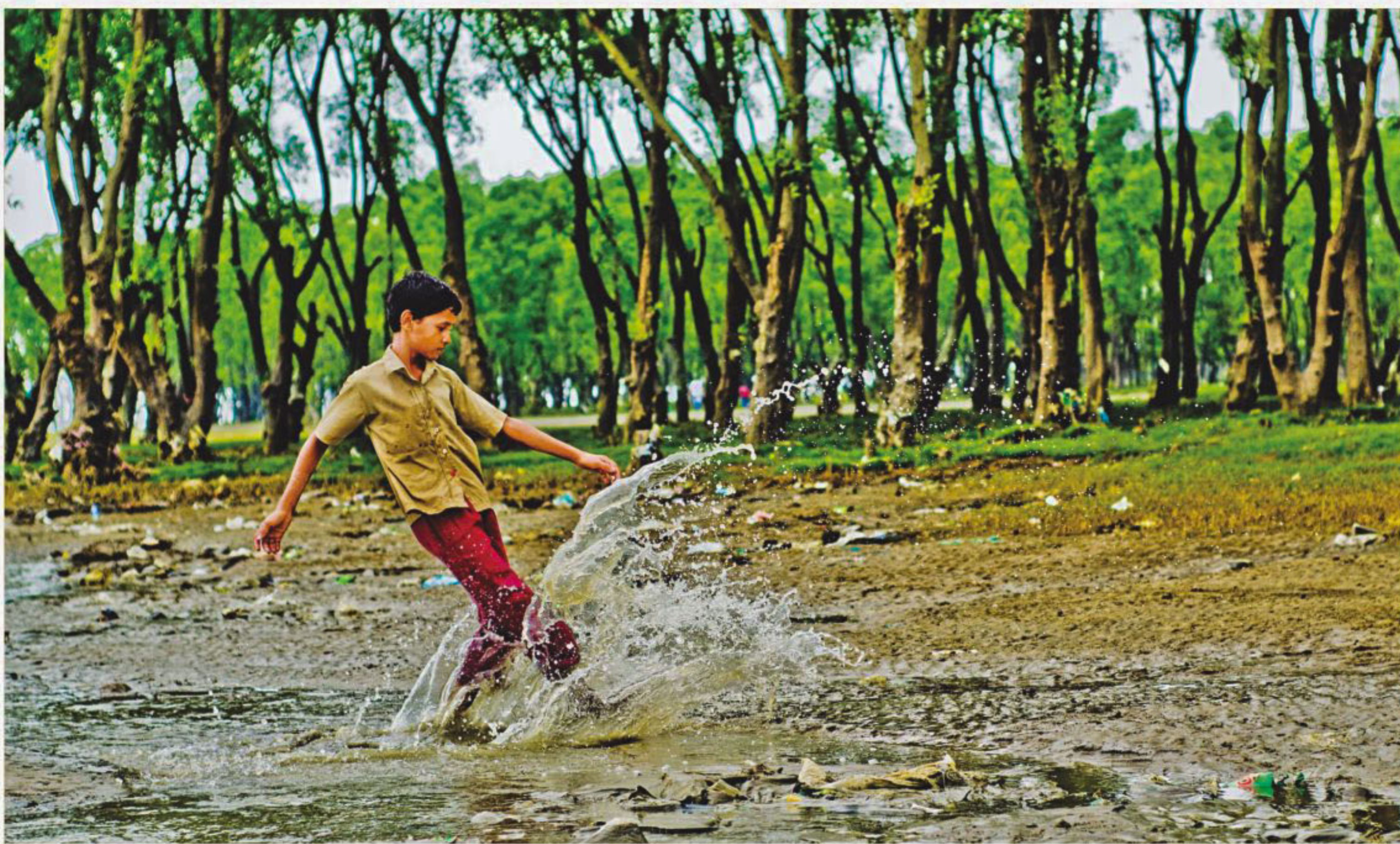
A boy finds merriment playing in a puddle after rain. This is one of the 10 photographs shortlisted under the theme "Rain" of The Daily Star's photo contest inPixel.