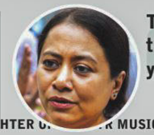
SULTANA KAMAL FREEDOM FIGHTER AND RIGHTS ACTIVIST

They can't accept their defeat in 1971 yet. They haven't