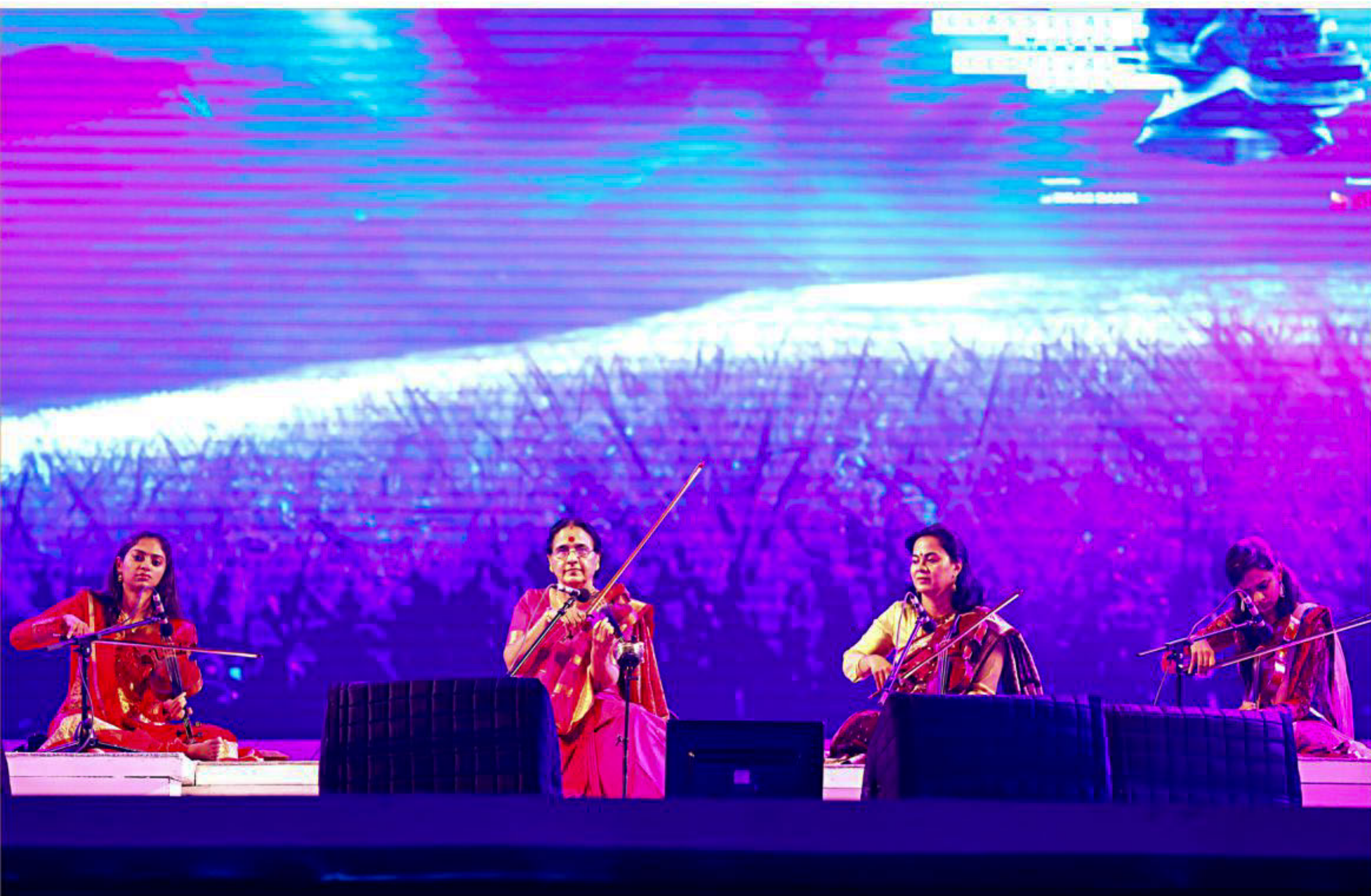
A three-generation Carnatic display by the singing violin of N Rajam, her daughter and granddaughters.