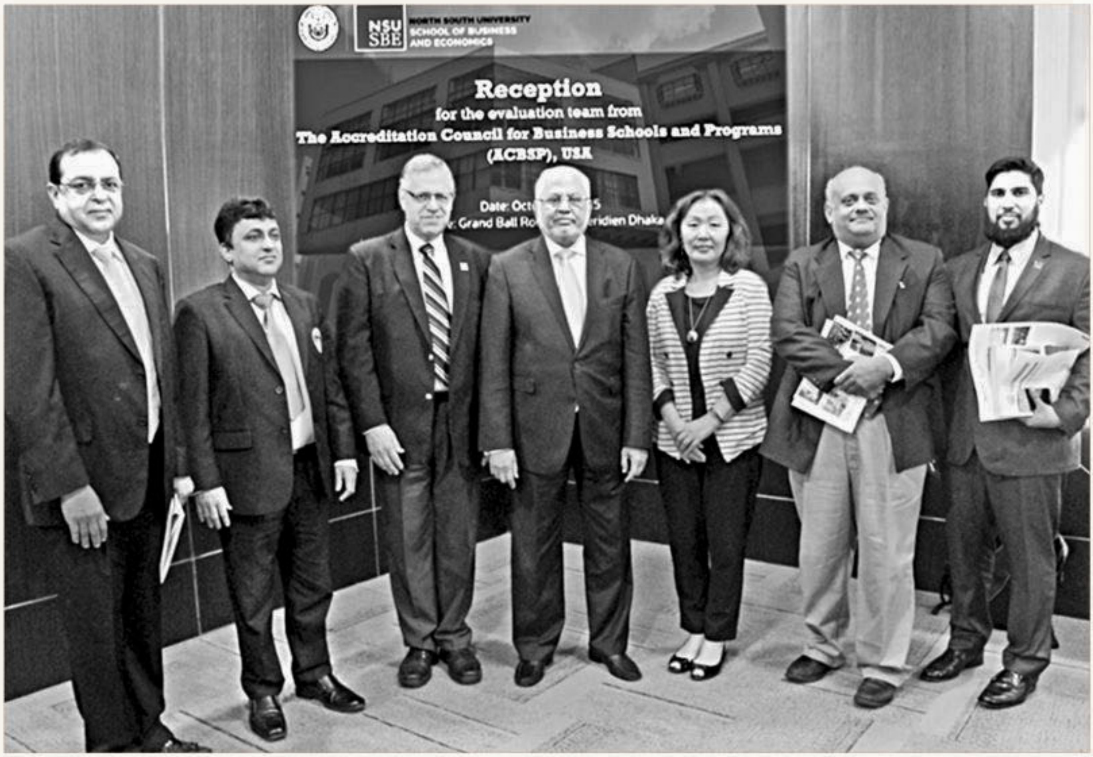
A photo call at a reception organised at Le Méridien Dhaka in the capital recently for an evaluation team from The Accreditation Council for Business Schools and Programs, USA which accredited the School of Business and Economics of North South University on Thursday.

Samah Razor Blades Industries Ltd. (a sister concern of GMG group), a leading razor blade manufacturing company in Bangladesh, invites applications from dedicated, dynamic, self-motivated applicants with MBA (major in HR) from a reputed university for the appointment in the department of Admin & HR. The applicant must have a minimum of 8 years of experience in any semi-government or reputed industrial organization in a senior position in the department of Admin & HR. We offer excellent working environment, attractive compensation package and performance-based career progression. Interested candidates are requested to submit the application along with their CV, 02 copies of recent PP size colored photographs, attested copy of National ID card, educational certificates and experience certificates to the Chairman, Samah Razor Blades Industries Ltd., ABC House, 9th floor, 8 Kemal Ataturk Avenue, Banani C/A, Dhaka by December 10, 2015 .