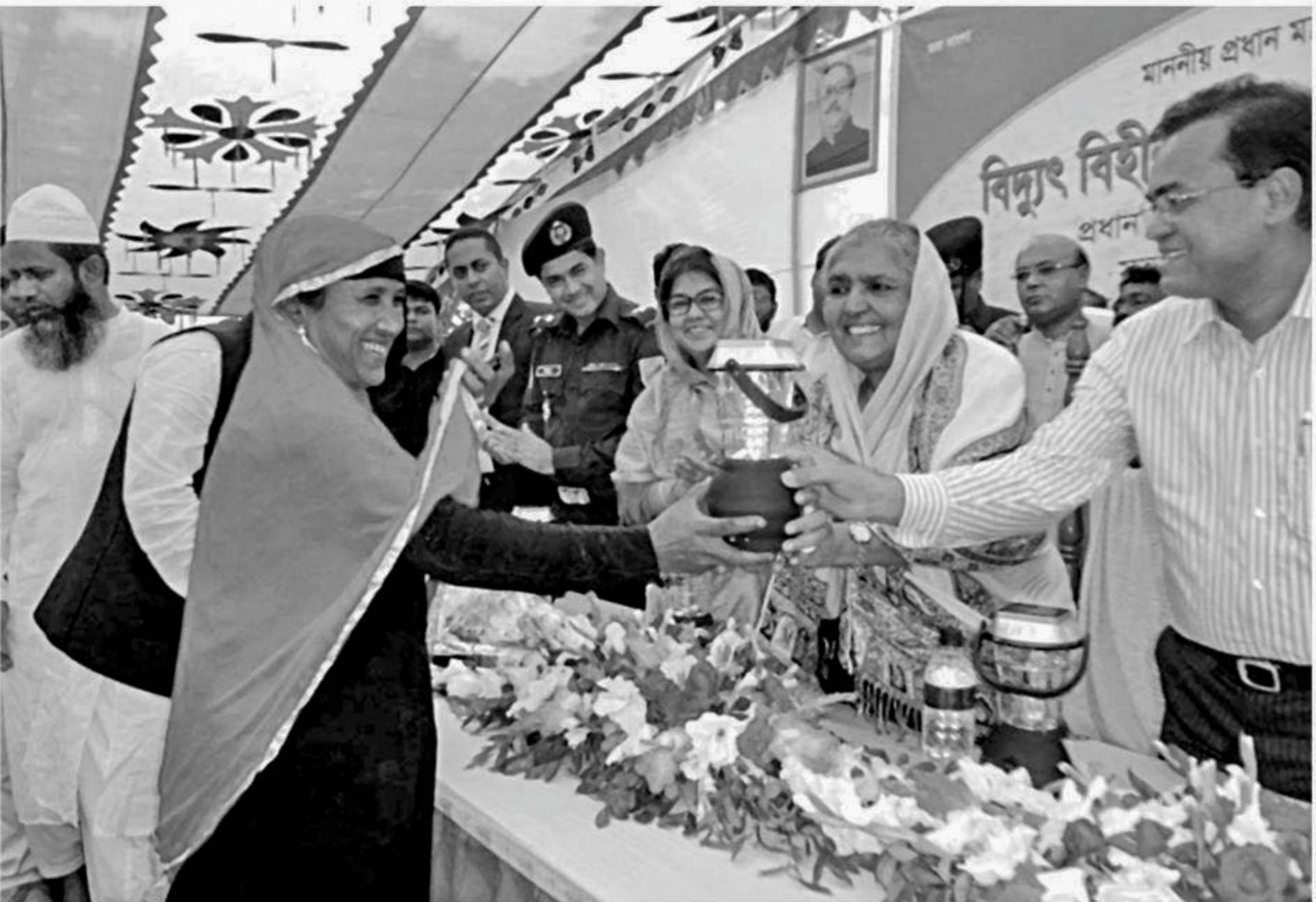
Agriculture Minister Matia Chowdhury distributes solar lights among members of 1500 households without electricity in char (landmass emerging from riverbed) areas of 10 unions under Louhajang upazila in Munshiganj district yesterday.

adjacent villages rushed to the town and rejoiced the victory by chanting slogans 'Joy Bangla' with the freedom fighters. Shortly after the Pakistani army started crackdown in Dhaka on March 26, freedom-loving people of Panchagarh brought out protest processions and observed different programmes there. Panchagarh remained free from Pakistani occupation army till 16 April in 1971. Later the occupation forces took control of the town and set up several camps in different areas of the then Panchagarh Police Station under Thakurgaon Sub-division. During the next several months, the Pakistan forces and their collaborators killed a large number of innocent people in the district.