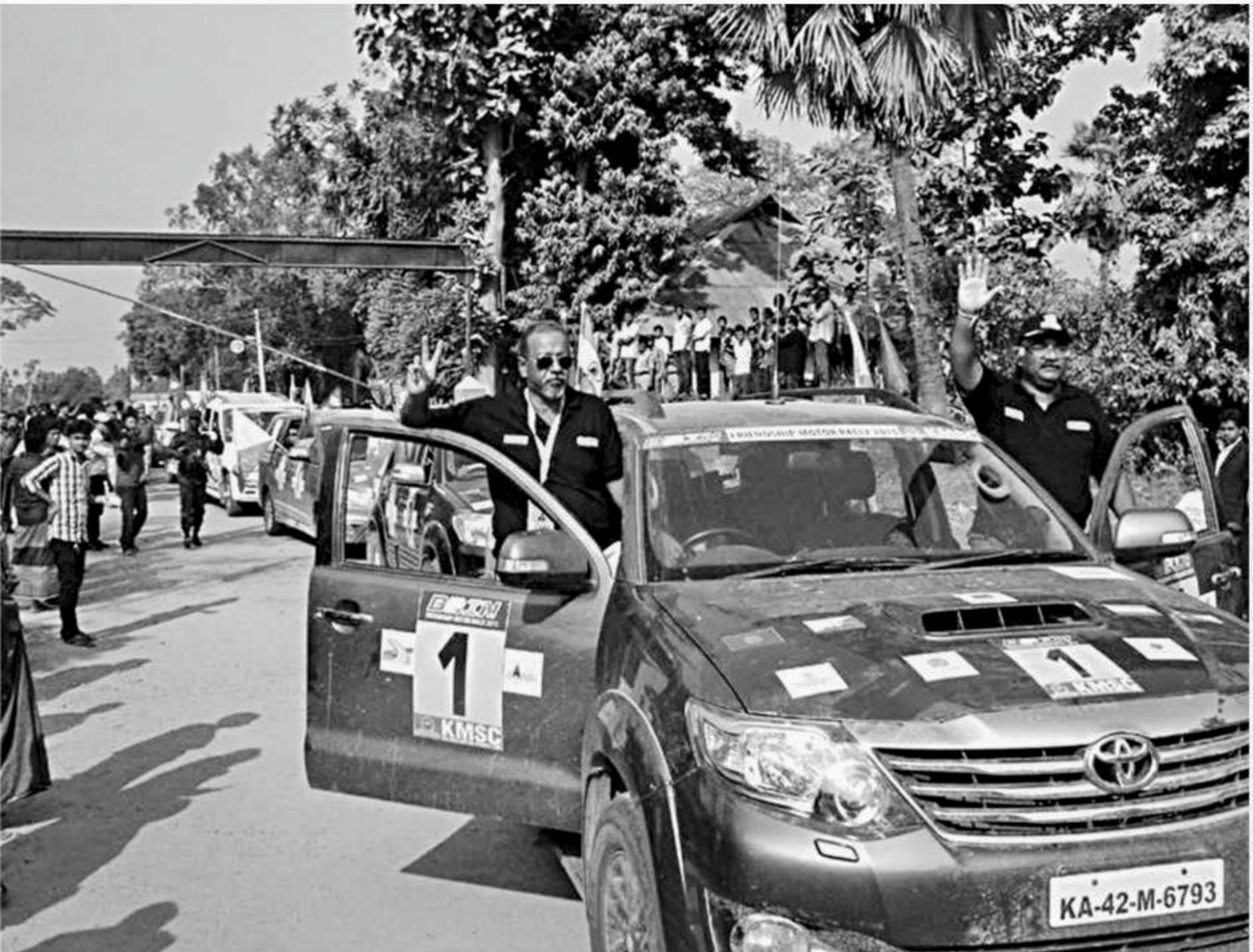
Delegates make welcome gestures as Bangladesh authorities accompanied by common people receive Bangladesh, Bhutan, India and Nepal Friendship Motor Rally during the latter's entrance to Bangladesh through Bilonia border in Feni district yesterday.