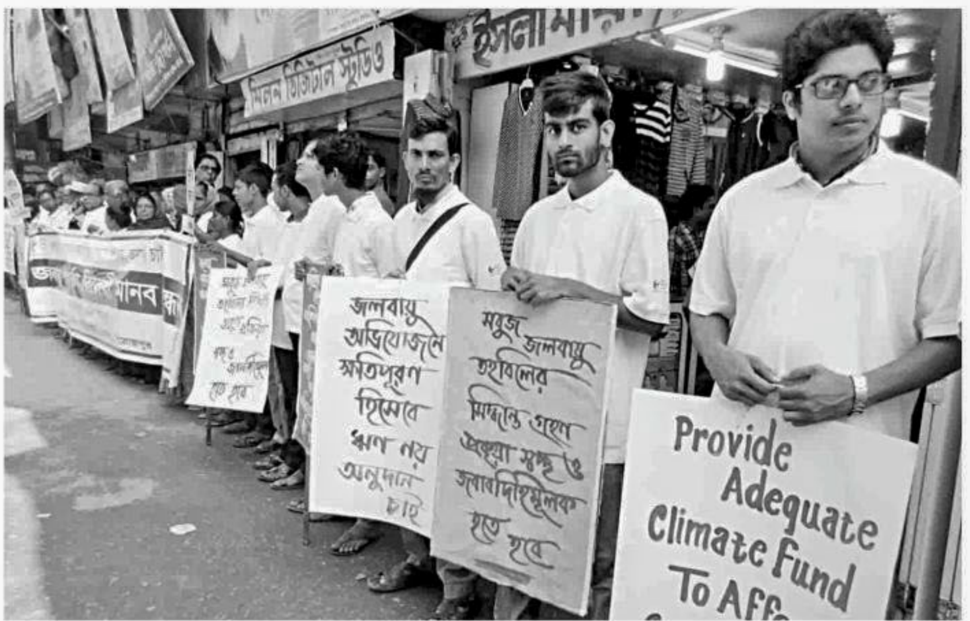
Sacheton Nagorik Committee, an associate organisation of Transparency International Bangladesh, forms a human chain on Town Club Road in Pirojpur town yesterday demanding adequate climate fund for the affected nations from the developed countries responsible for most of the pollution that puts serious negative impact on climate.