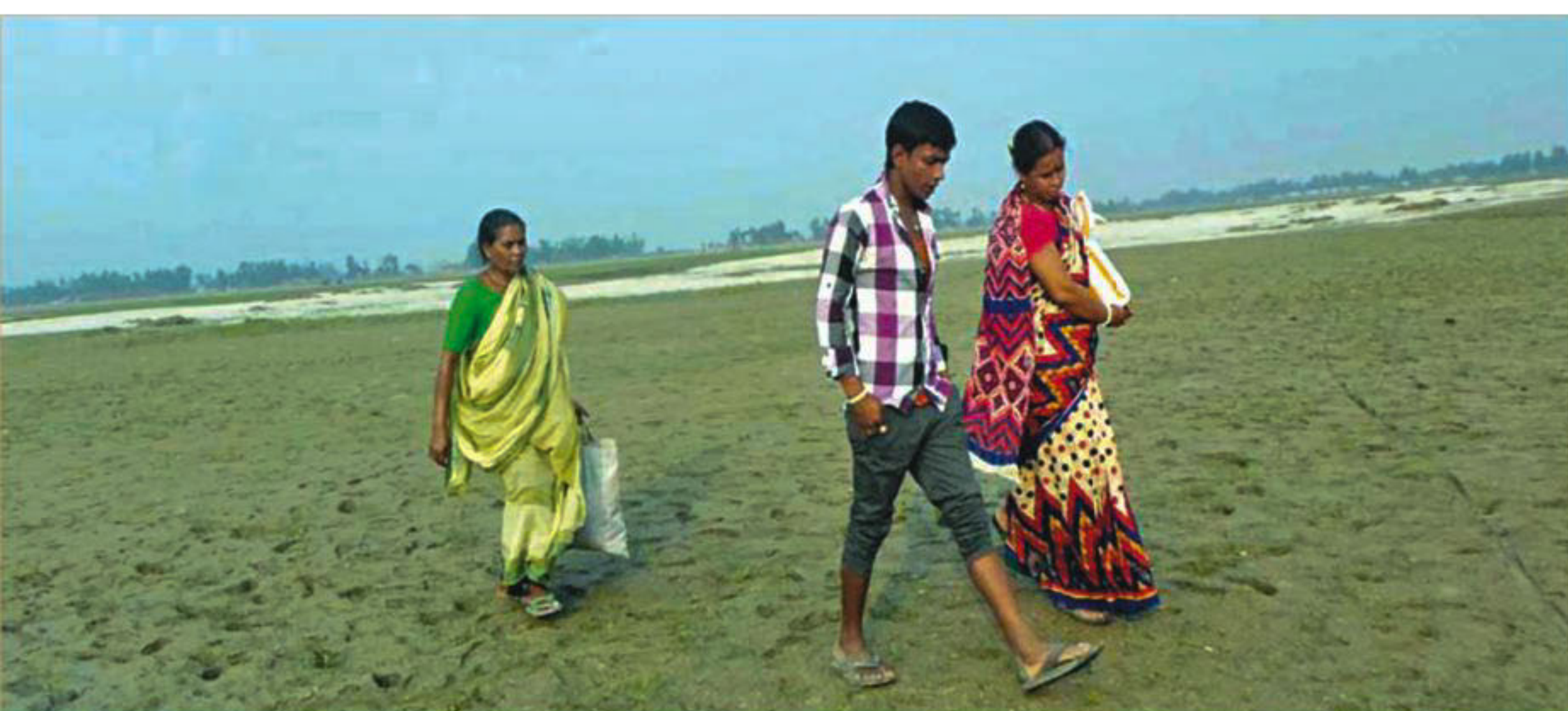
People walk across a sandy char of the Teesta in Gaibandha. Lack of water flow has rendered vast areas of this major river of the country into dry land.