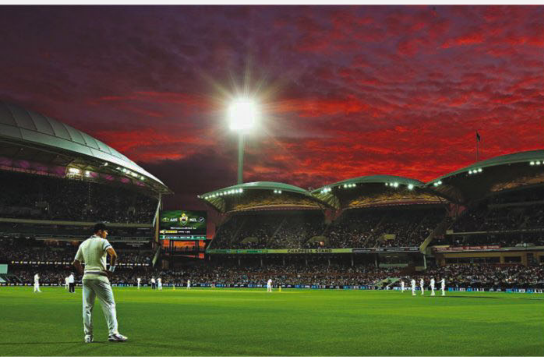
The Adelaide Oval became part of history on Friday as day-night Test with pink ball made its debut through the third Test between Australia and New Zealand.

"The pitch was a difficult factor, it was turning and bouncing whether it was the new ball or the old one," said Amla. "It was a hard game, but we are obviously very disappointed." SCORES IN BRIEF INDIA: First innings 215 SOUTH AFRICA: First innings 79 INDIA: Second innings 173 SOUTH AFRICA: Second innings 185 all out (Elgar 18, Amla 39, Du Plessis 39, Duminy 19; Ashwin 7-66, Mishra 3-51) Result: India won by 124 runs; Lead four-match series 2-0. Player-of-the-match: Ravichandran Ashwin.