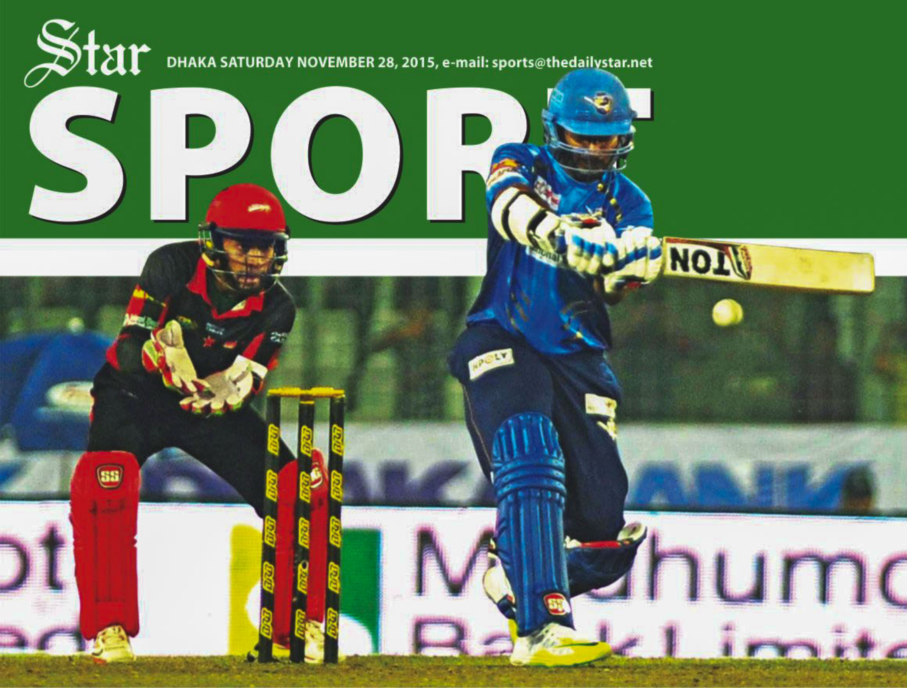
Kumar Sangakkara's 56-ball 75 powered Dhaka Dynamites to a 34-run win over Sylhet Superstars in their BPL fixture at the Sher-e-Bangla National Stadium in Mirpur last night.