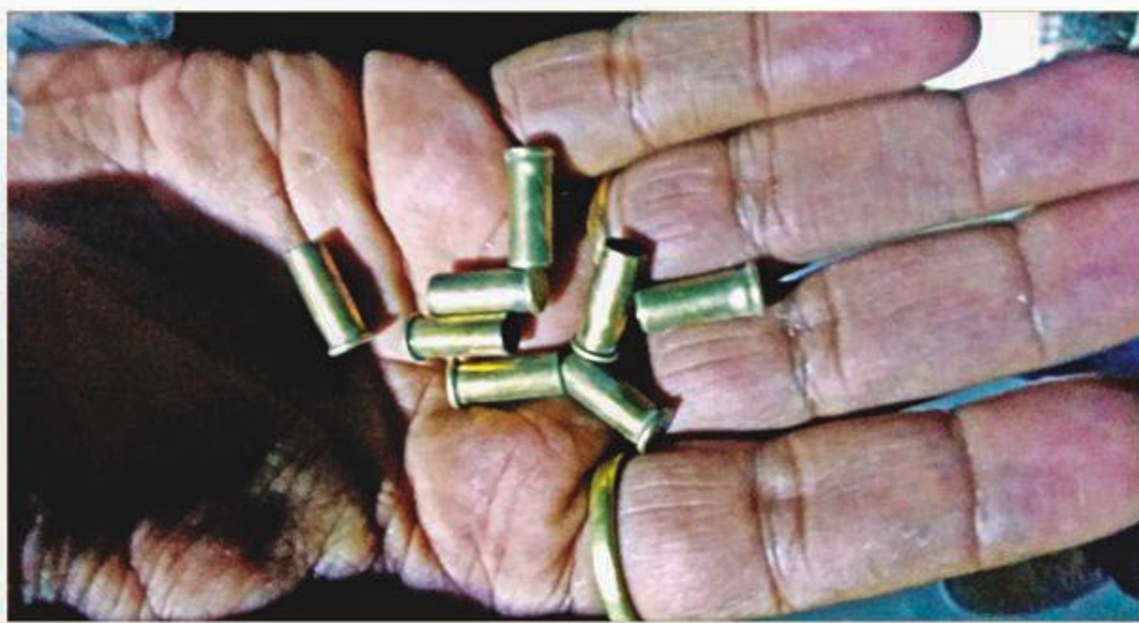
The wife of Moazzem Hossain, the muezzin killed in a gun attack on a Shia mosque in Bogra, wails at her house in Shibganj upazila's Haripur yesterday morning. Bottom left , crowds in front of Masjid Al Hussain, the mosque which came under the attack, in Haripur Bus Stop area. Bottom right , bullet shells found at the crime scene.