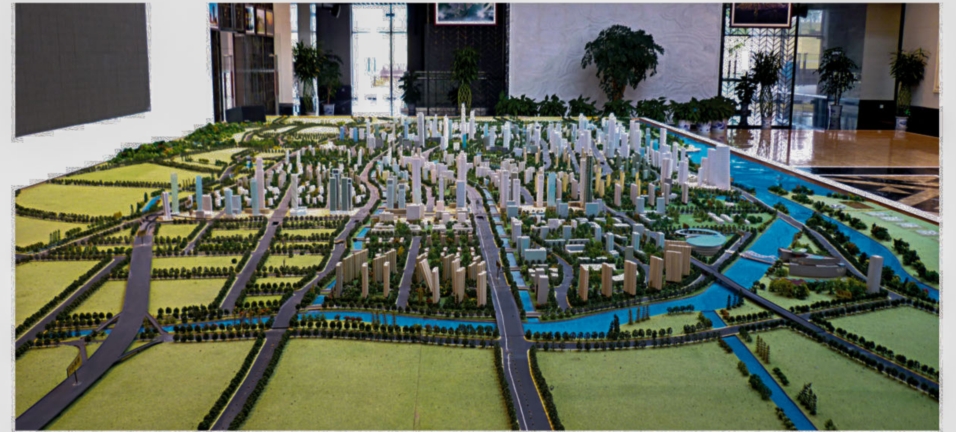
Development plans for Nanjing city.

The Silk Road was a network of trade routes, formally established during the Han Dynasty. The use of the road had been initiated from Chang'an (now Xian) in the East and ended in the Mediterranean in the West, linking China to the Roman Empire. As China's silk was the chief trade product, German geographer Ferdinand von Richthofen named it the Silk Road in 1877. It was not just one road but rather a series of major