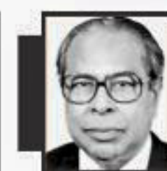
KIBRIA MURDER CASE

Shykh Seraj has received more than 50 prestigious awards including Ekushey Padak in 1995, and the AH Boerma Award by UN's Food and Agriculture Organization (FAO).