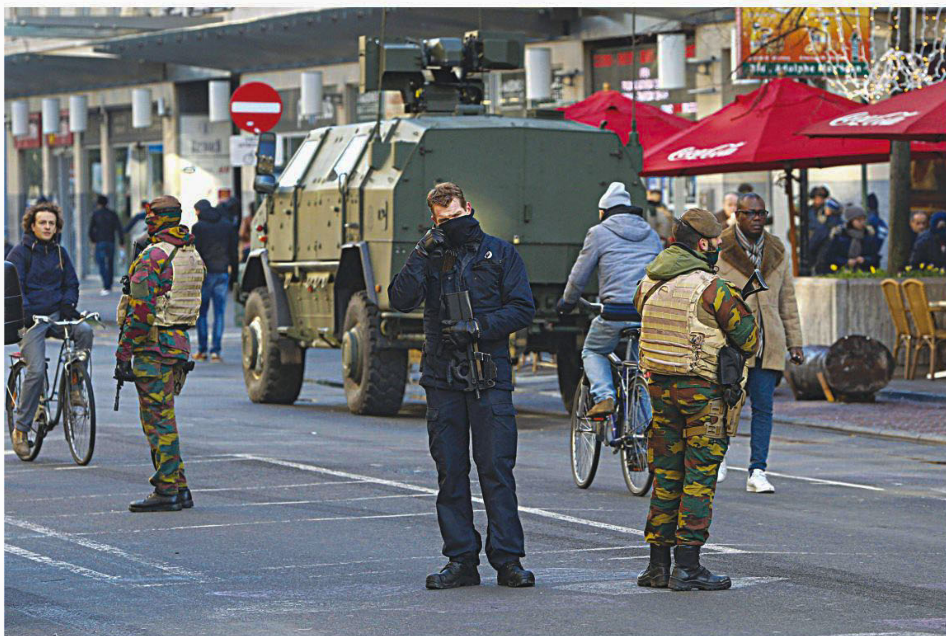
Belgian soldiers and police patrol central Brussels yesterday as police searched the area during high level of security following the recent deadly Paris attacks.