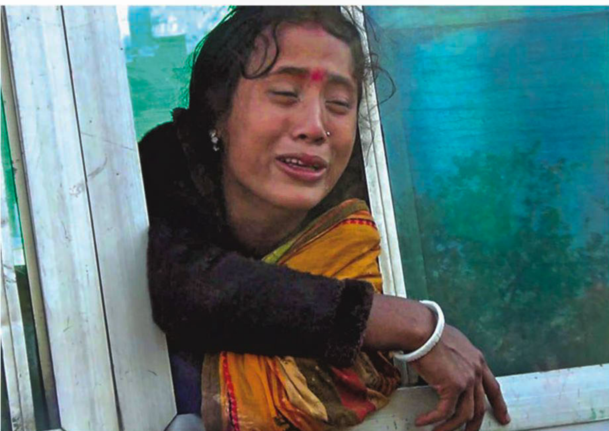
A woman from the former enclave of Coathbhajini in Debiganj of Panchagarh bids a tearful goodbye to her relatives at Gajakathi High School ground in Debiganj. A second batch of 147 people of 28 families from two erstwhile enclaves in the district left for India yesterday.