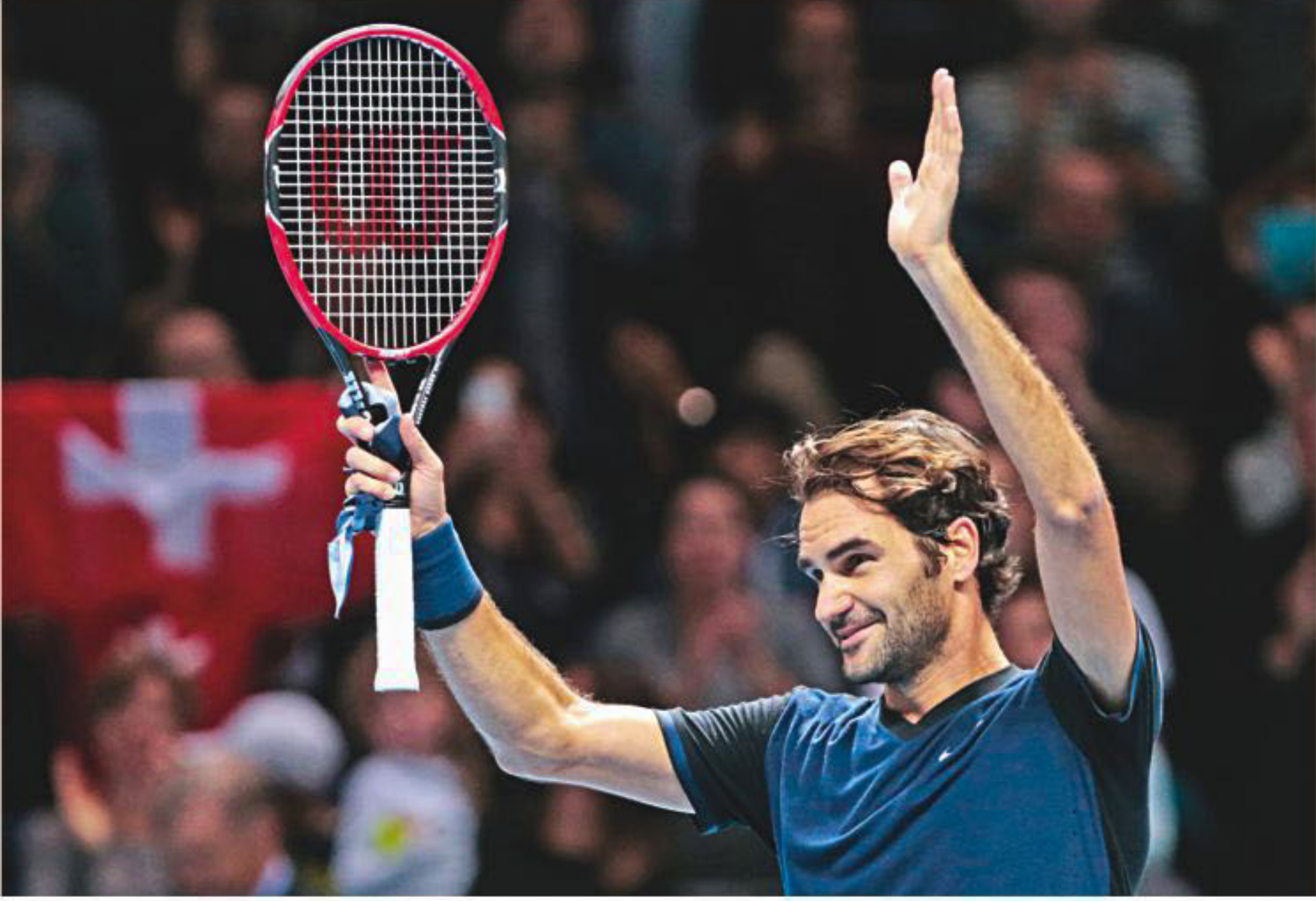
Roger Federer came out on top in the battle of the Swiss as he defeated Stan Wawrinka in the semifinal of the the ATP World Tour Final at the O2 Arena in London yesterday. Undeclared so far, Federer will take on world number one Novak Djokovic in the final.

this point and ended the contest with a straightforward service game. The pair shook hands warmly at the net. Djokovic said clashes against Federer were always nervy affairs as he prepared to face his rival for a second time this week -- Federer having got the better of the Serb in the group stage. But Djokovic had a near-perfect performance as he beat Rafael Nadal 6-3, 6-3 in their semifinal clash on Saturday. "I don't feel unbeatable, but it definitely feels great when I'm playing the way I played," Djokovic said after his dazzling display against Nadal. "I've lost against Roger three times this year. When he's on, it's hard to play him," said the Serb, who has beaten Federer four times in 2015, all in finals. "We always play matches with a lot of tension. There is a lot at stake. I know I have to be on top to win against him." Djokovic could claim $1,050,000 in prize money if he wins, while Federer would receive $2,228,000 for winning the title undefeated.