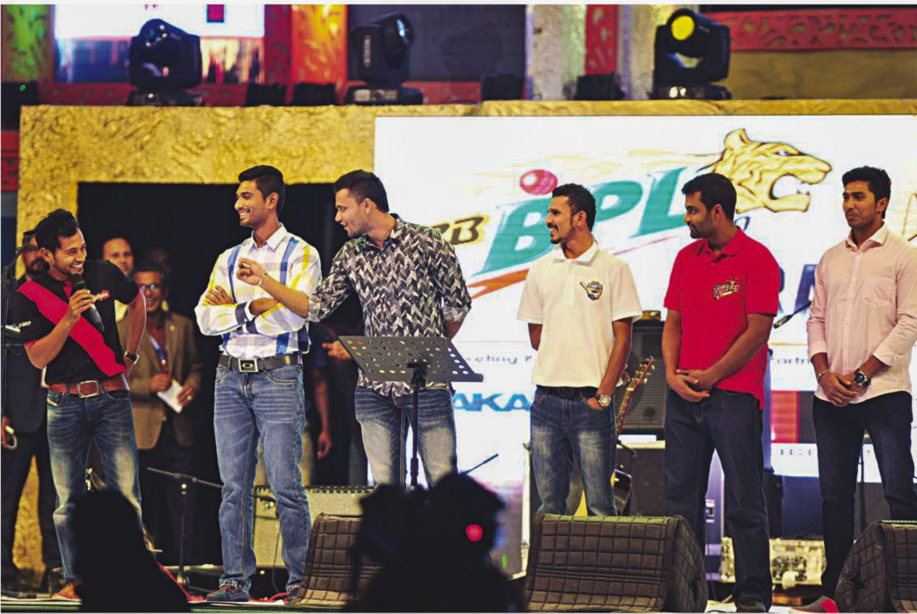
WE'RE NOW ENEMIES: With the BPL all set to kick-off, friends become foes. Mashrafe Bin Mortaza captures that sentiment as he seemingly tells Mushfiqur Rahim to watch his back during the BPL opening ceremony at the Sher-e-Bangla National Stadium in Mirpur last night.