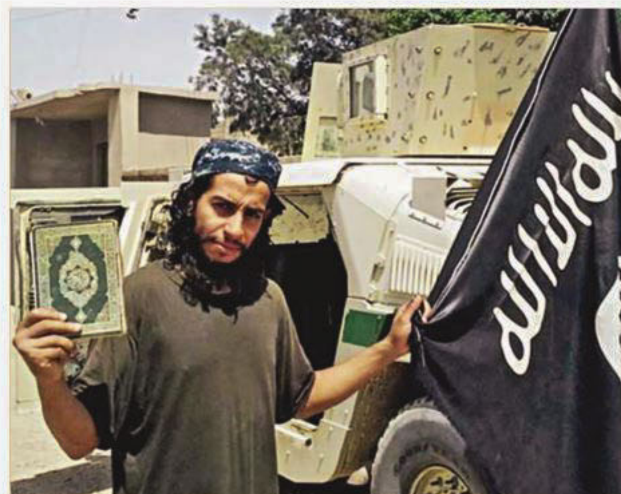
Abdelhamid Abaaoud, suspected ringleader of the Paris attacks, who was killed in a police raid in the French capital on Wednesday. The picture was published in the Islamic State's online magazine Dabiq.