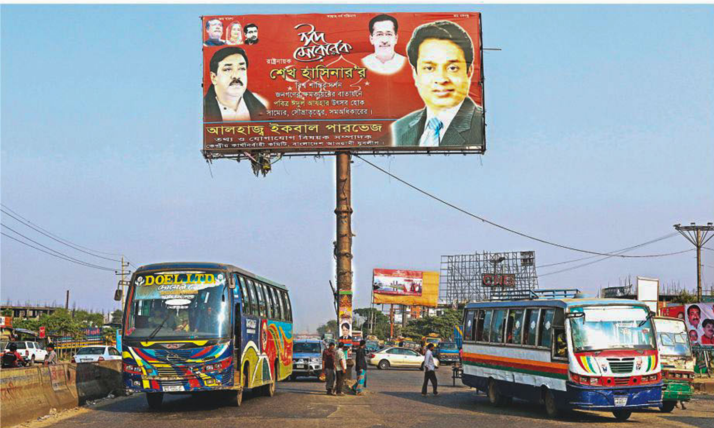
A huge hoarding stands slap bang in the middle of Dhaka-Chittagong highway at Signboard intersection of Narayanganj. Many are baffled that the authorities concerned have failed to recognise the danger posed by such billboards. The photo was taken earlier this month.