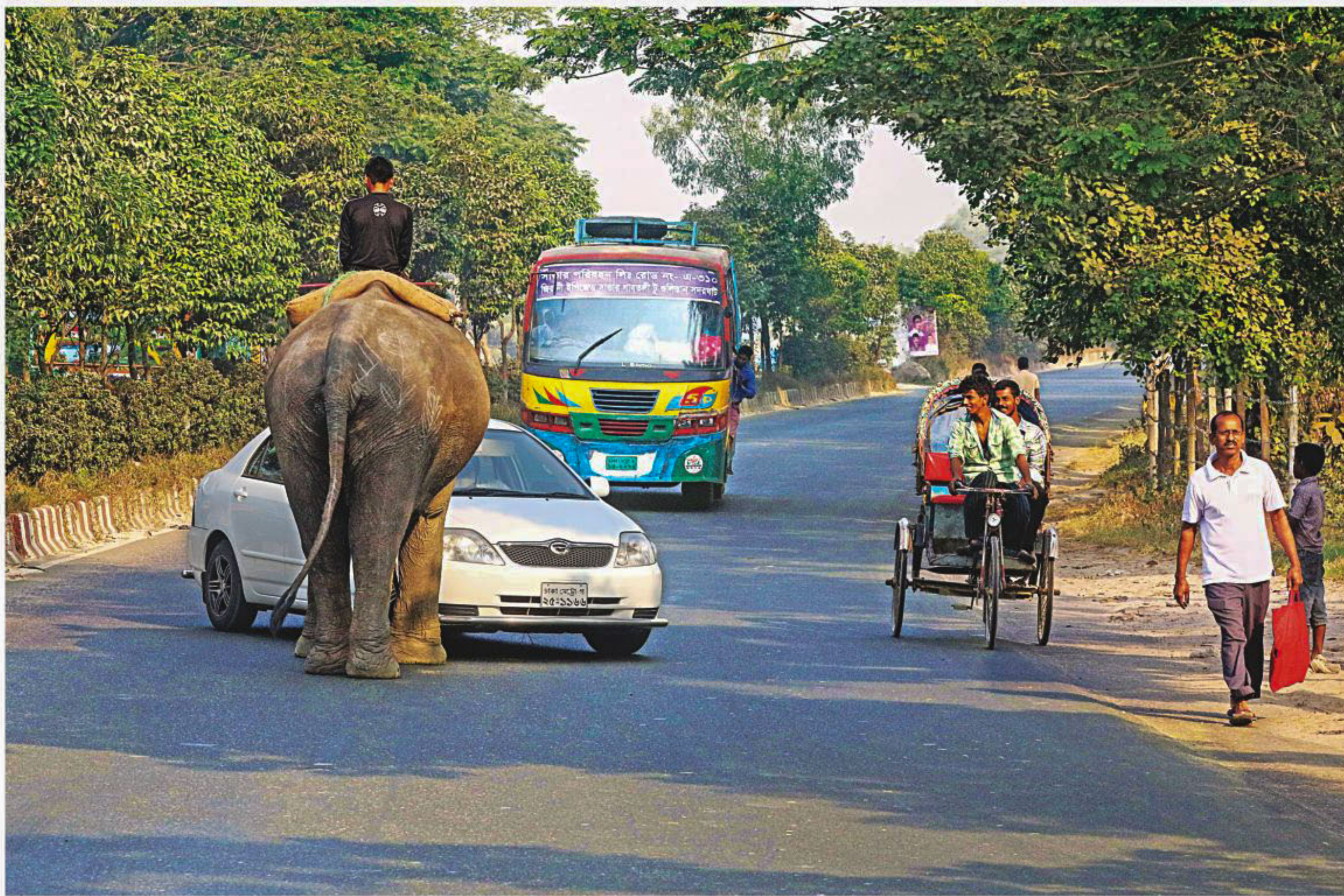
A FREAKISH WAY OF EXTORTION INDEED! Ignoring the risk of an accident, a mahout intercepts a car with his elephant on the Dhaka-Aricha highway at Hemayetpur of Savar to extort money from its passengers. The photo was taken on Saturday.