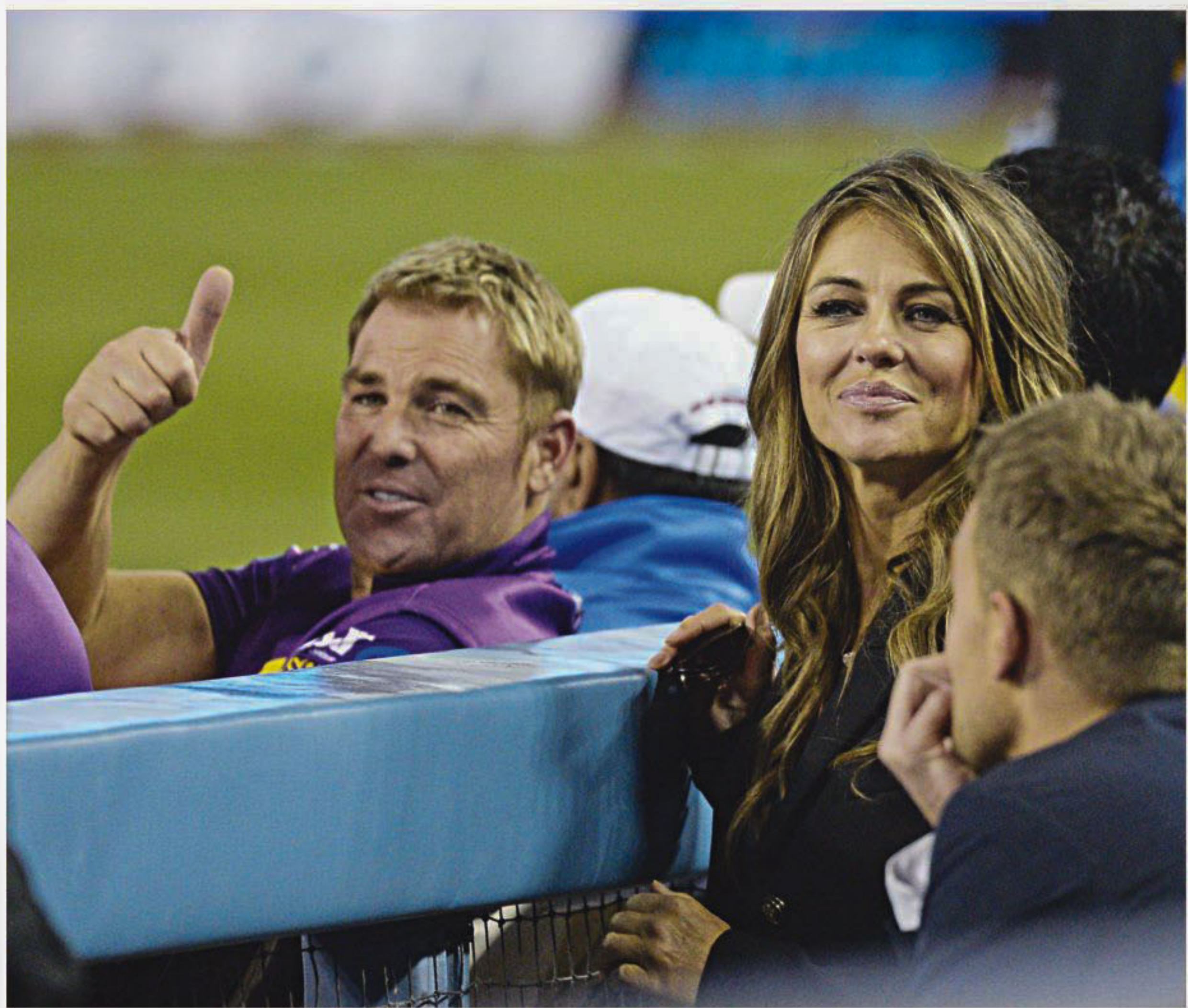
OLD FRIENDS REUNITE: Shane Warne chats with his ex-wife actress Elizabeth Hurley (R) at the Dodger Stadium yesterday. Warne's Warriors overcame Sachin's Blasters' 219-run target with just one ball to spare to claim their third victory of the three-match Cricket All Stars Series.

Bad weather washed out the entire day's play at the second Test between India and South Africa in Bangalore Sunday, with more rain forecast that could see the match end in a draw. The scheduled start was initially delayed by an hour as constant rain since early morning left the outfield too wet for play at the Chinnaswamy stadium. A slight let up in the drizzle raised hopes the match might resume, but the covers were back on a few minutes before the umpires were due to walk out and play was finally called off at 2 pm (0830 GMT). The forecast is for more rain for the remaining three days with a cyclonic depression hovering over the Bay of Bengal. On the rain-free first day, South Africa were shot out for 214 after being sent in to bat in overcast conditions and India replied with 80 for no loss by stumps. India lead the four-match series 1-0. The third Test