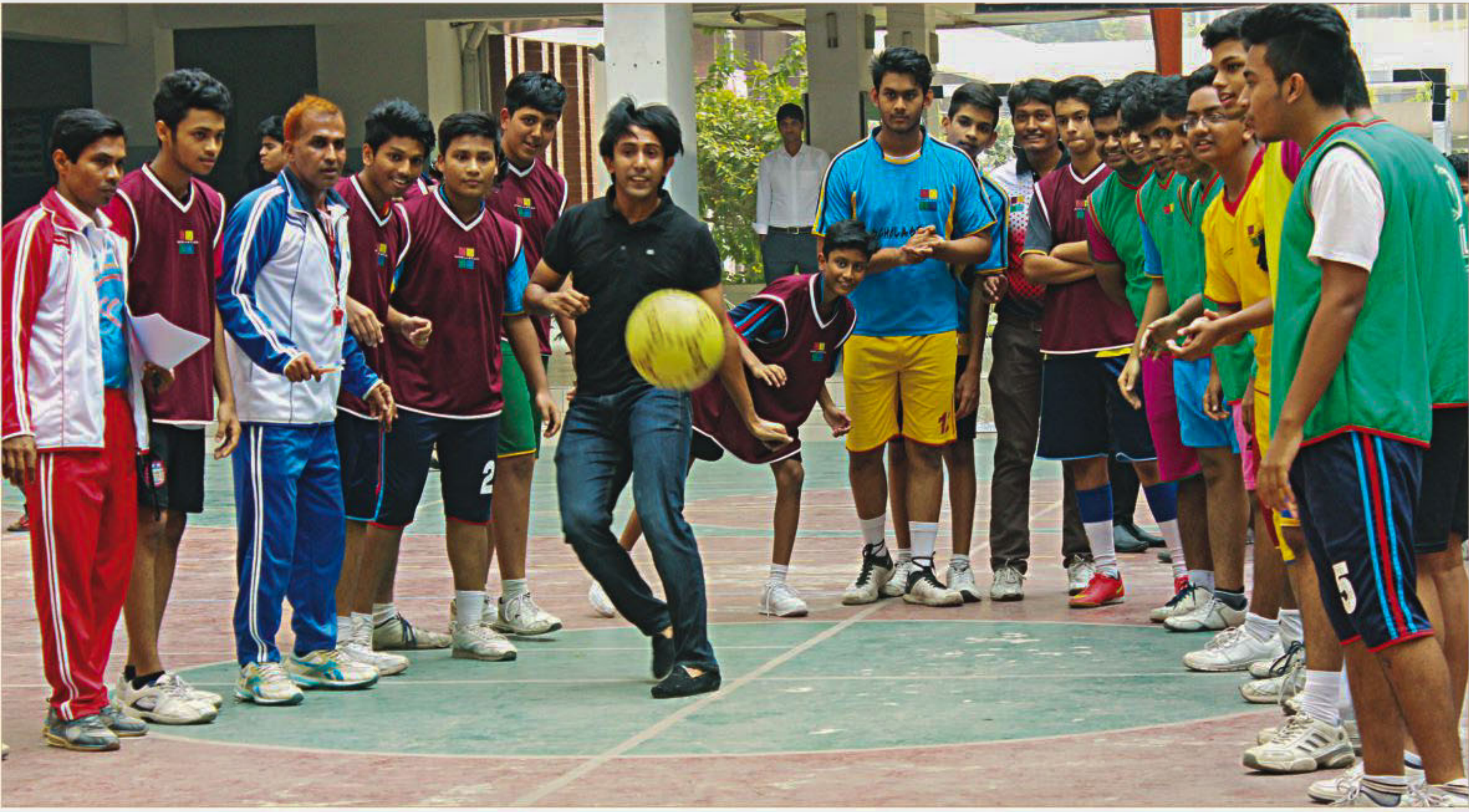
Bangladesh football captain Mamumul Islam shoots for the target at the Scholastica School's Mirpur branch yesterday during a promotional campaign, aimed at providing lucky winners with match tickets for Bangladesh's World Cup qualifying fixture against Australia at the Bangabandhu National Stadium on Tuesday.