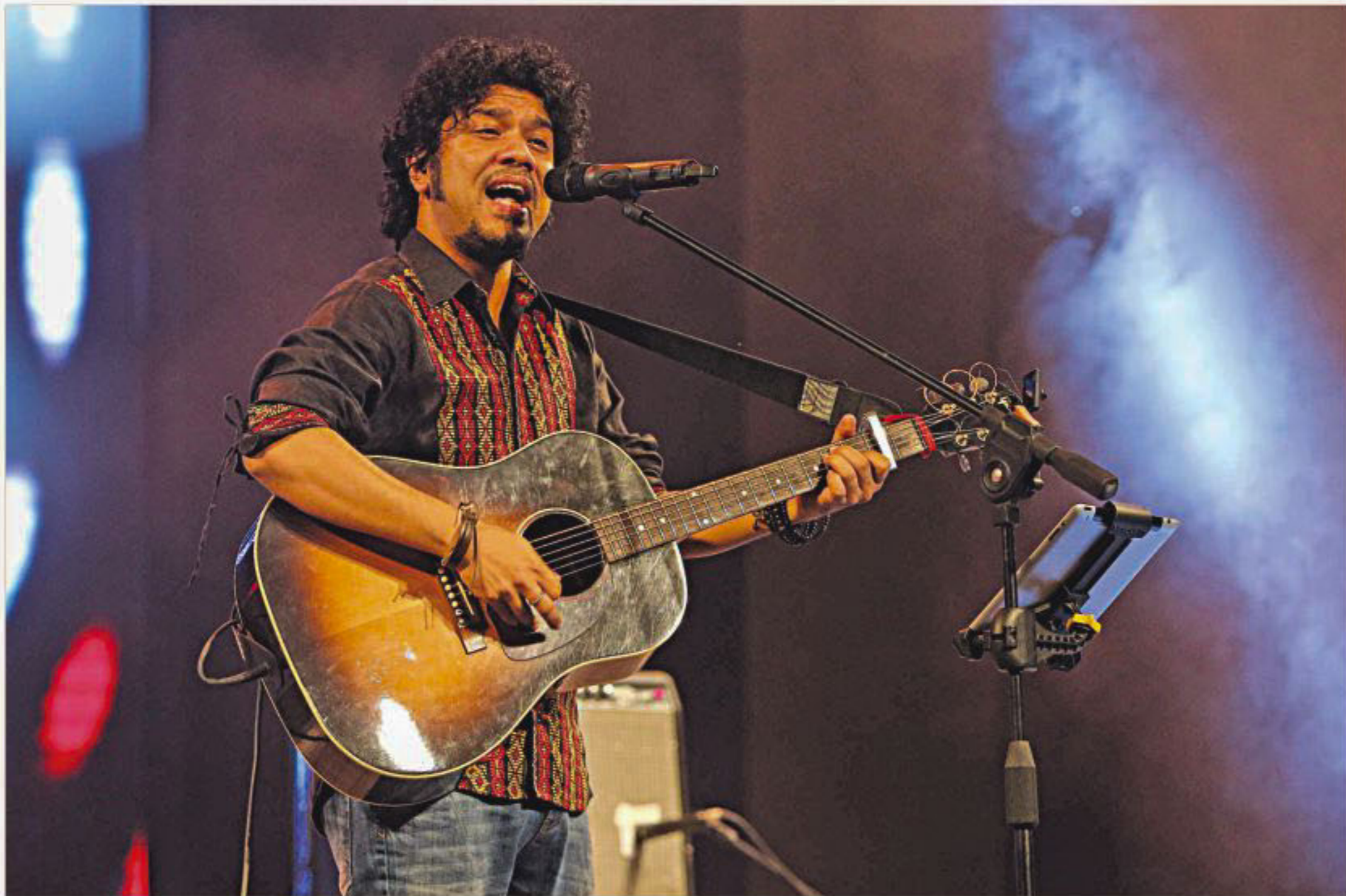
Indian singer Papon enthalls the audience with his performance on the opening night of the three-day Dhaka International Folk Festival at the capital's army stadium last night.