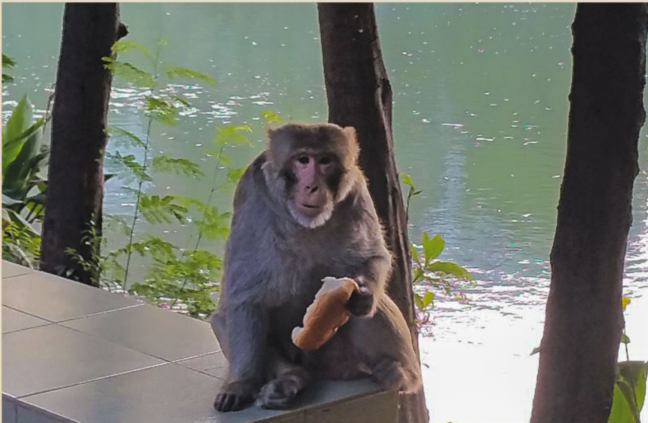
This monkey has made Uttara Sector-13 Park his home. He has been there for the last few months and is not afraid of people. Park visitors often offer him bread and biscuits. The photo was taken a couple of days ago.