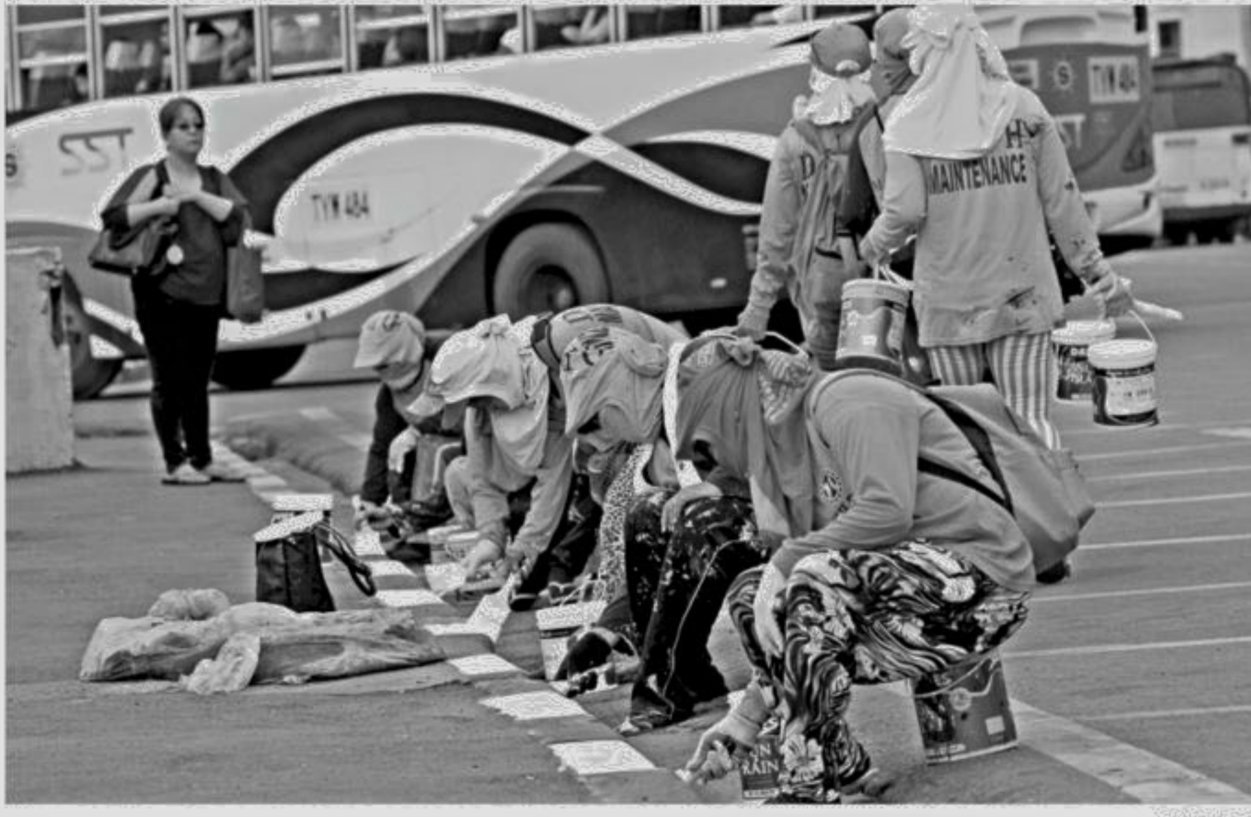
Government workers re-paint the sidewalks of a main street in Manila on Monday, as part of a clean-up project in preparation for the upcoming Asia-Pacific Economic Cooperation summit on November 18-19.

"Our objective is to complete the joint strategic study