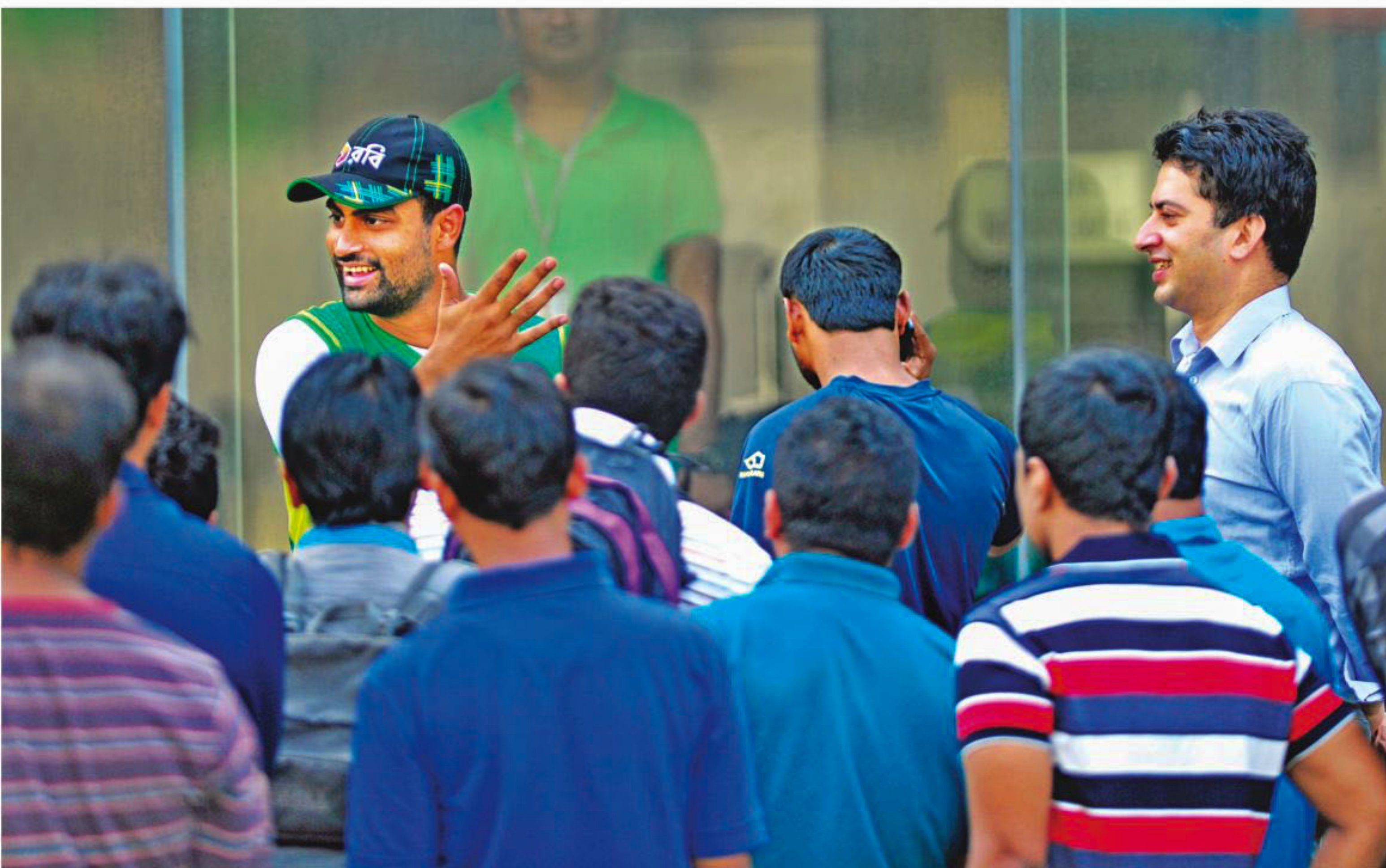
Bangladesh opener Tamim Iqbal happily complies with the queries of reporters at the Sher-e-Bangla National Stadium in Mirpur yesterday. The left-hander must have been contemplating a big knock when the Tigers take on Zimbabwe in the final match of the ODI series today.