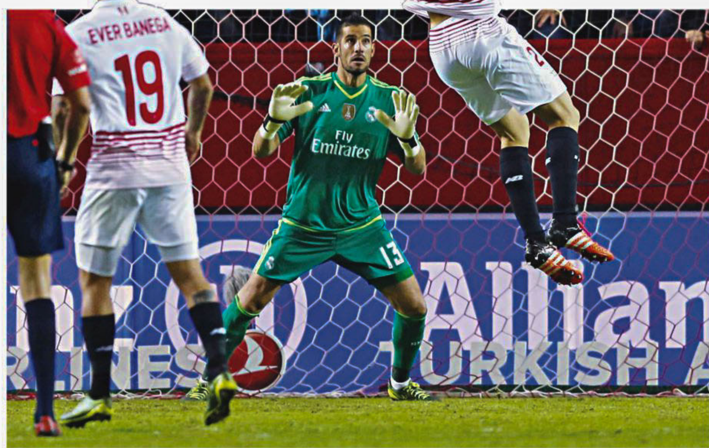
Sevilla striker Fernando Llorente (R) heads in the third goal against Real Madrid during their Primera Liga encounter at the Ramon Sanchez Pizjuan Stadium on Sunday.