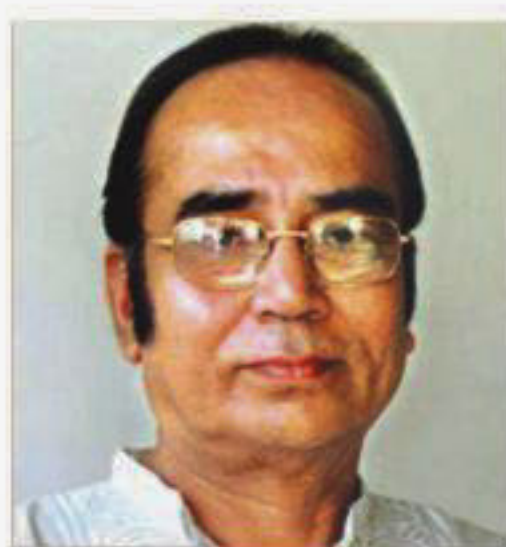
Death anniversary CITY DESK

In the statement, TIB said it was a matter of great concern that international organisations have been technically encouraging vulnerable countries, and in some cases compelling them, to take loans from the GCF.