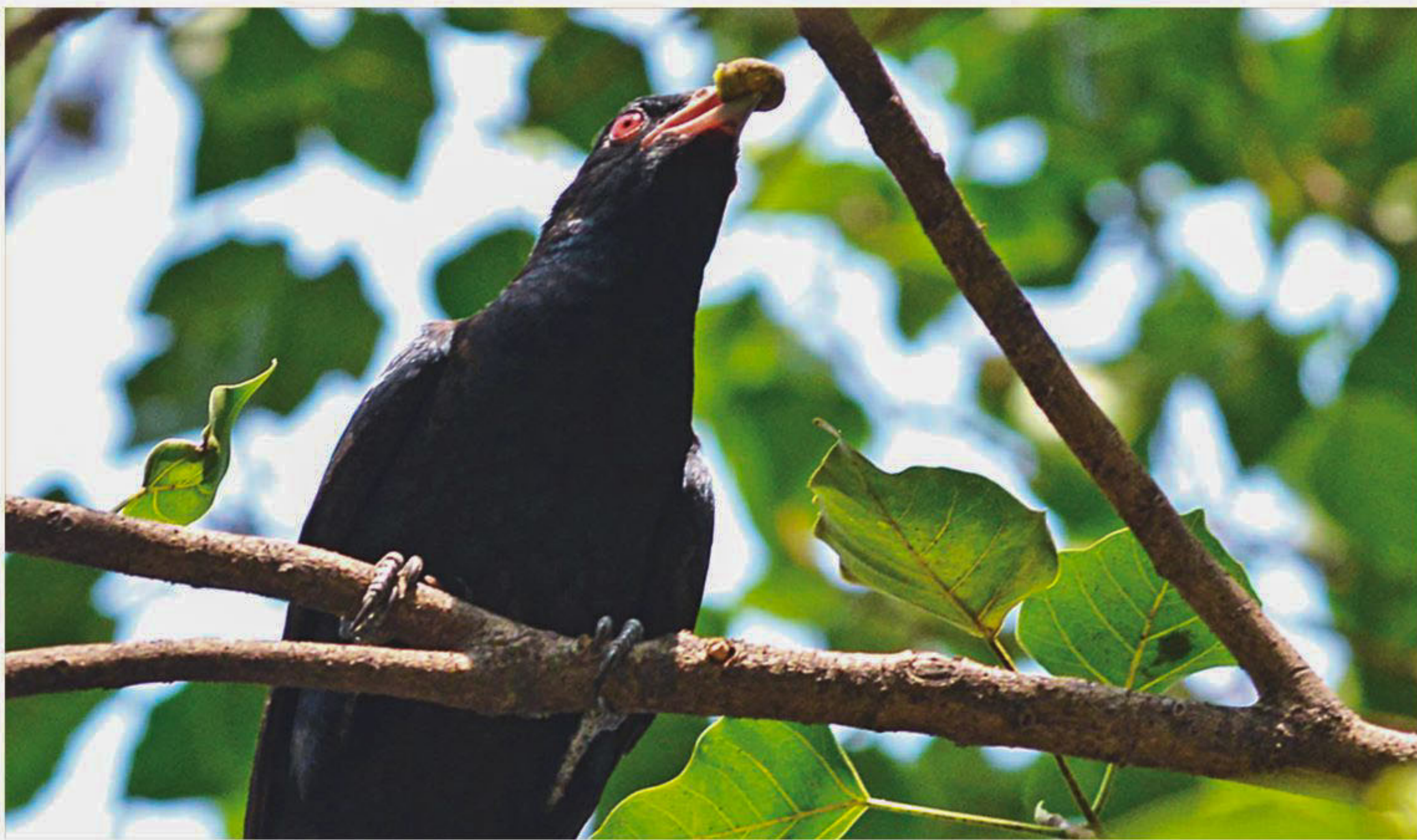
The sighting of cuckoos which are lovingly called the harbinger of spring appears to be a little bit early this year with winter just setting in. The photo was taken in Chittagong city's Jamal Khan area yesterday.

"I didn't file any general diary with any police station to this end. I am now standing in parliament, which has the highest authority. I urge the honourable Speaker to ensure