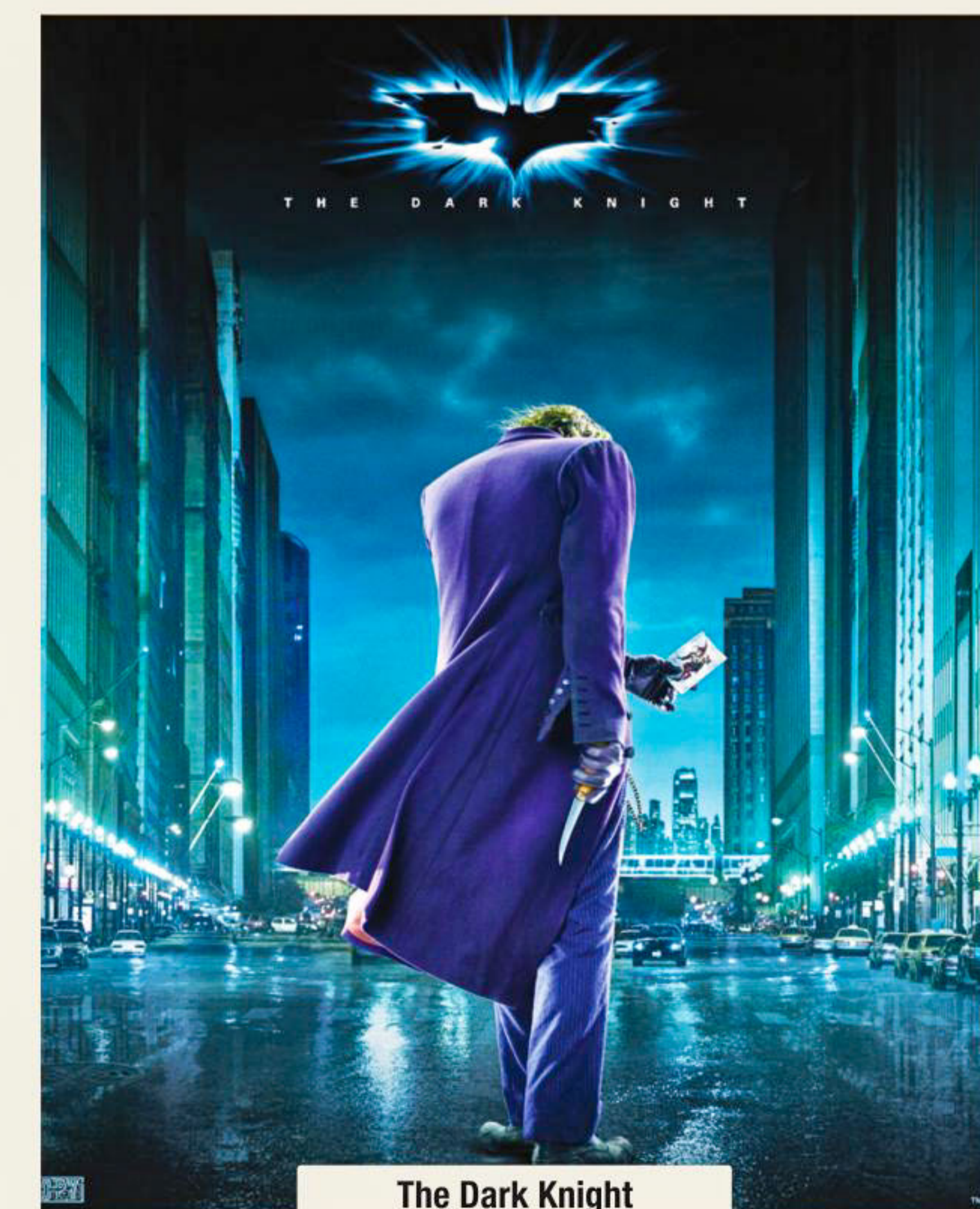
The Dark Knight