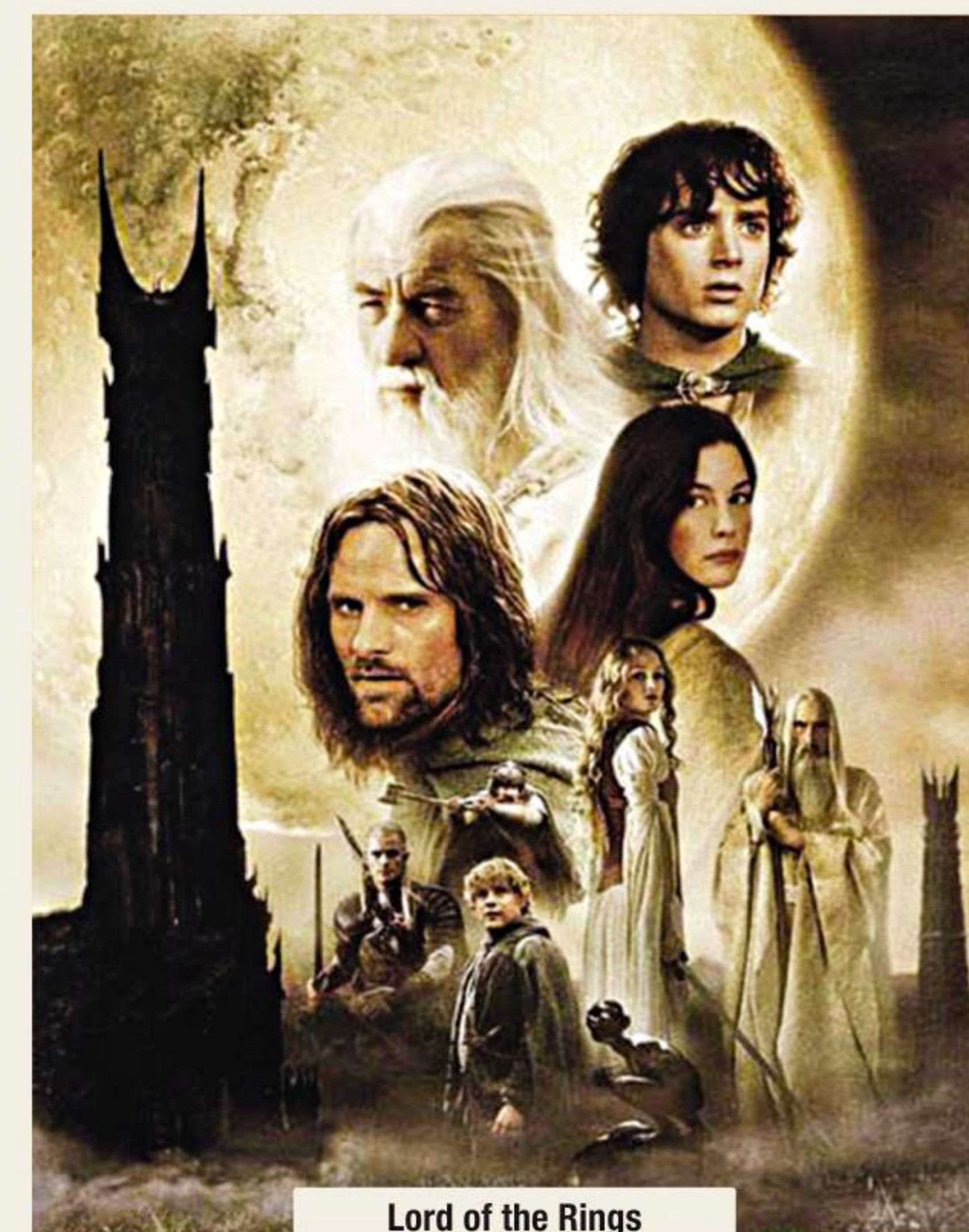
Lord of the Rings