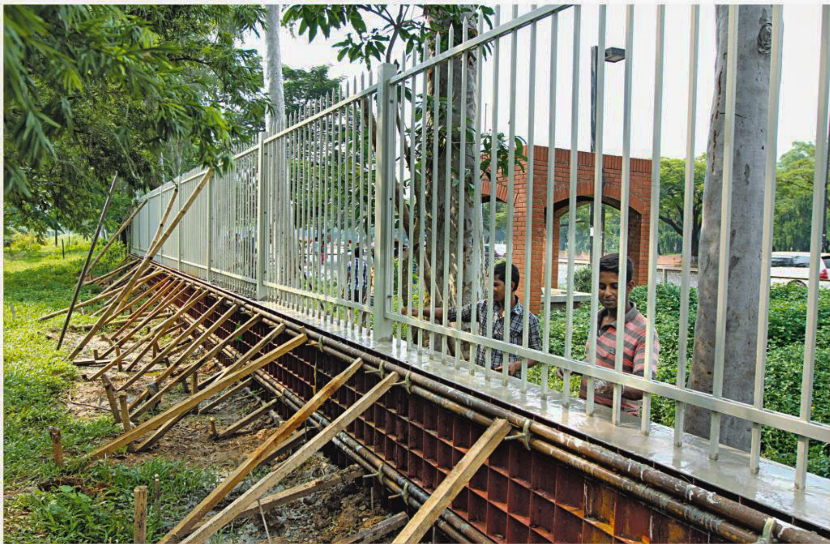
Workers building a high fence around the Jatiya Sangsad Bhaban complex at the north-eastern end near the Lake Road on October 10. Despite widespread criticism, the authorities are going ahead with the fence, which some experts have termed illegal.