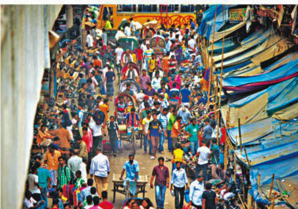
Buses, right, block almost the entire Gulistan Police Box intersection in the capital while trying to get more passengers, creating tailbacks yesterday. Hawkers occupy most of nearby streets and entire pavements, forcing pedestrians to walk on the road risking their lives, left and bottom.