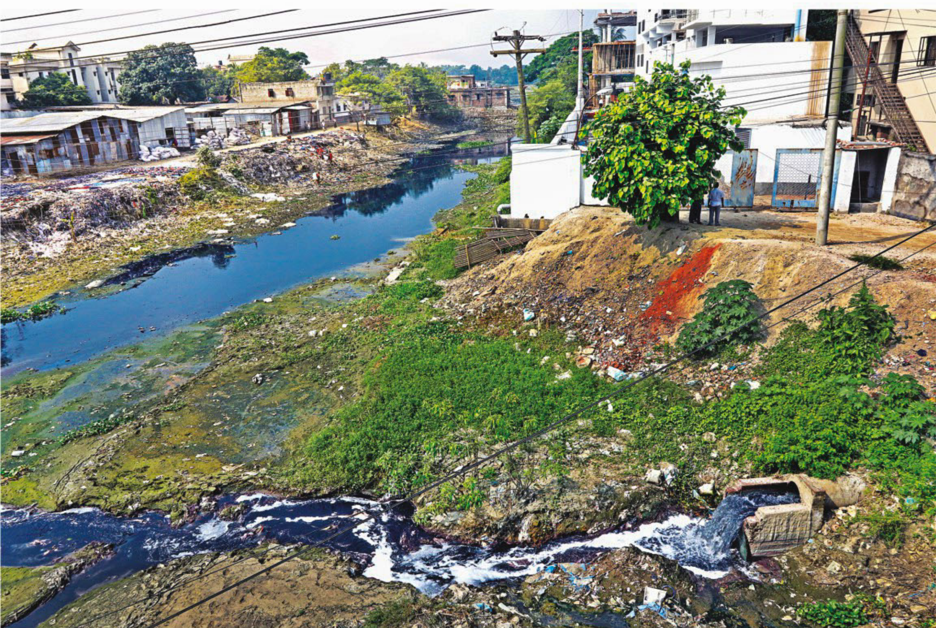
Discharge of untreated waste of dyeing factories into the Karmapara canal in Savar pollutes the water. To make things worse, local influential people dump garbage choking the canal. The photo was taken yesterday near Savar Bank Town.