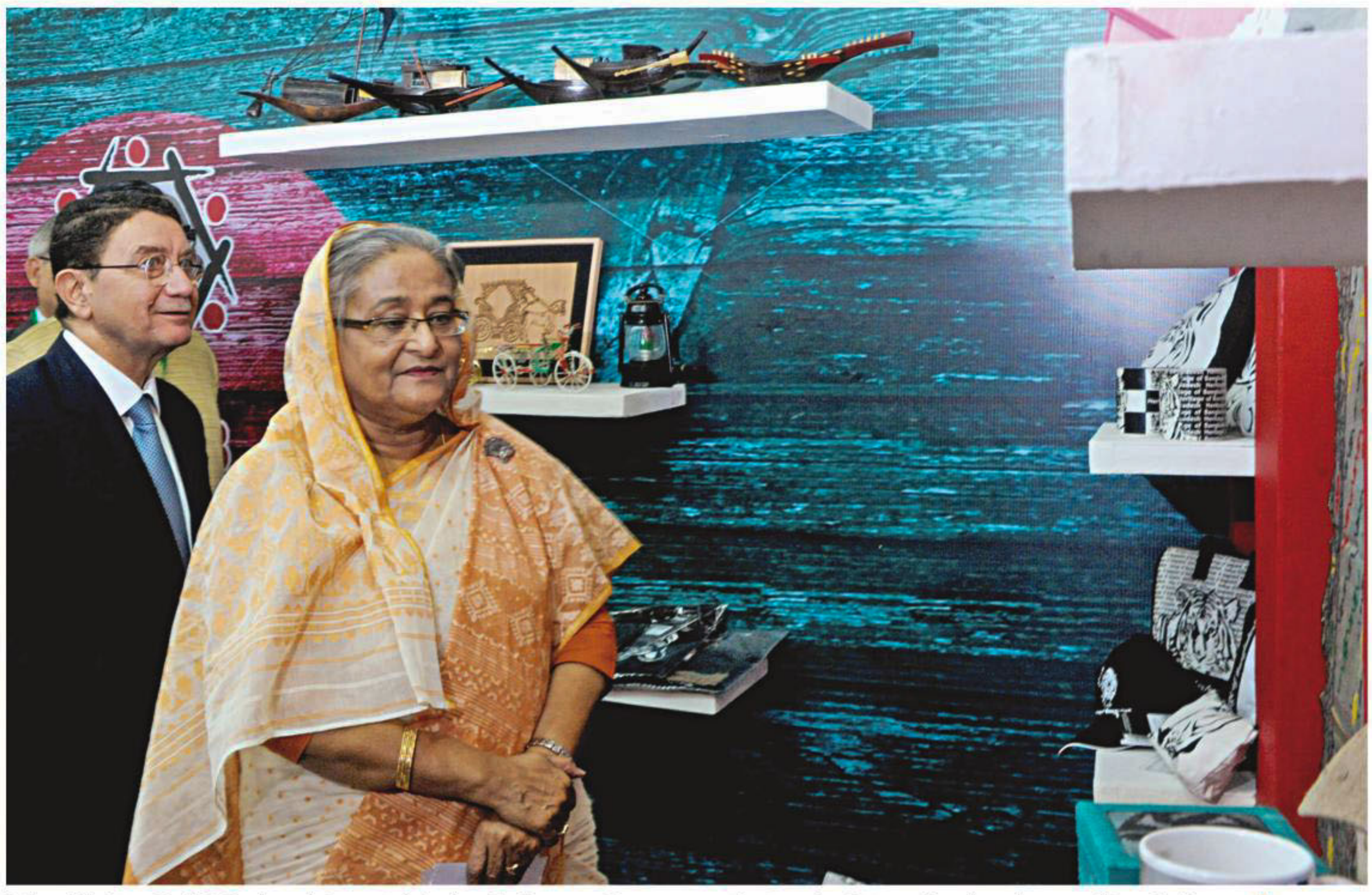
Prime Minister Sheikh Hasina visits a stall during the inaugural ceremony of a two-day international conference, "Developing Sustainable and Inclusive Buddhist Heritage and Pilgrimage Circuits in South Asia's Buddhist Heartland", at the capital's Bangabandhu International Conference Centre yesterday. There is a souvenir corner outside the auditorium.