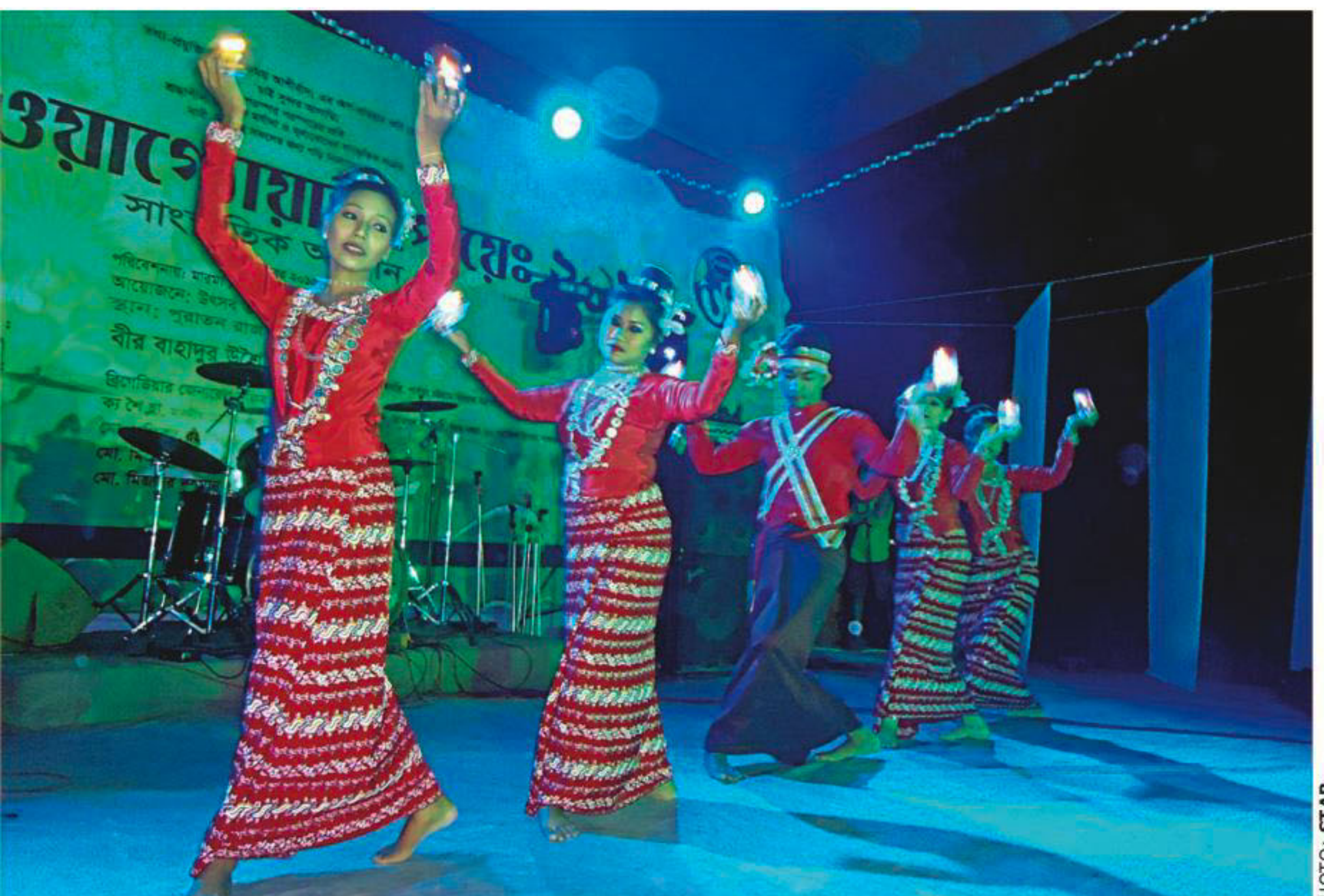
Marma artists perform a traditional dance during their religious festival of Maha Waygyawai Powe, the equivalent to Probarana Purnima, on Puratan Rajar Math in Bandarban town last evening. The indigenous communities, mostly holding Buddhist faith, across the Chittagong Hill Tracts will celebrate the occasion with three days of festivities.