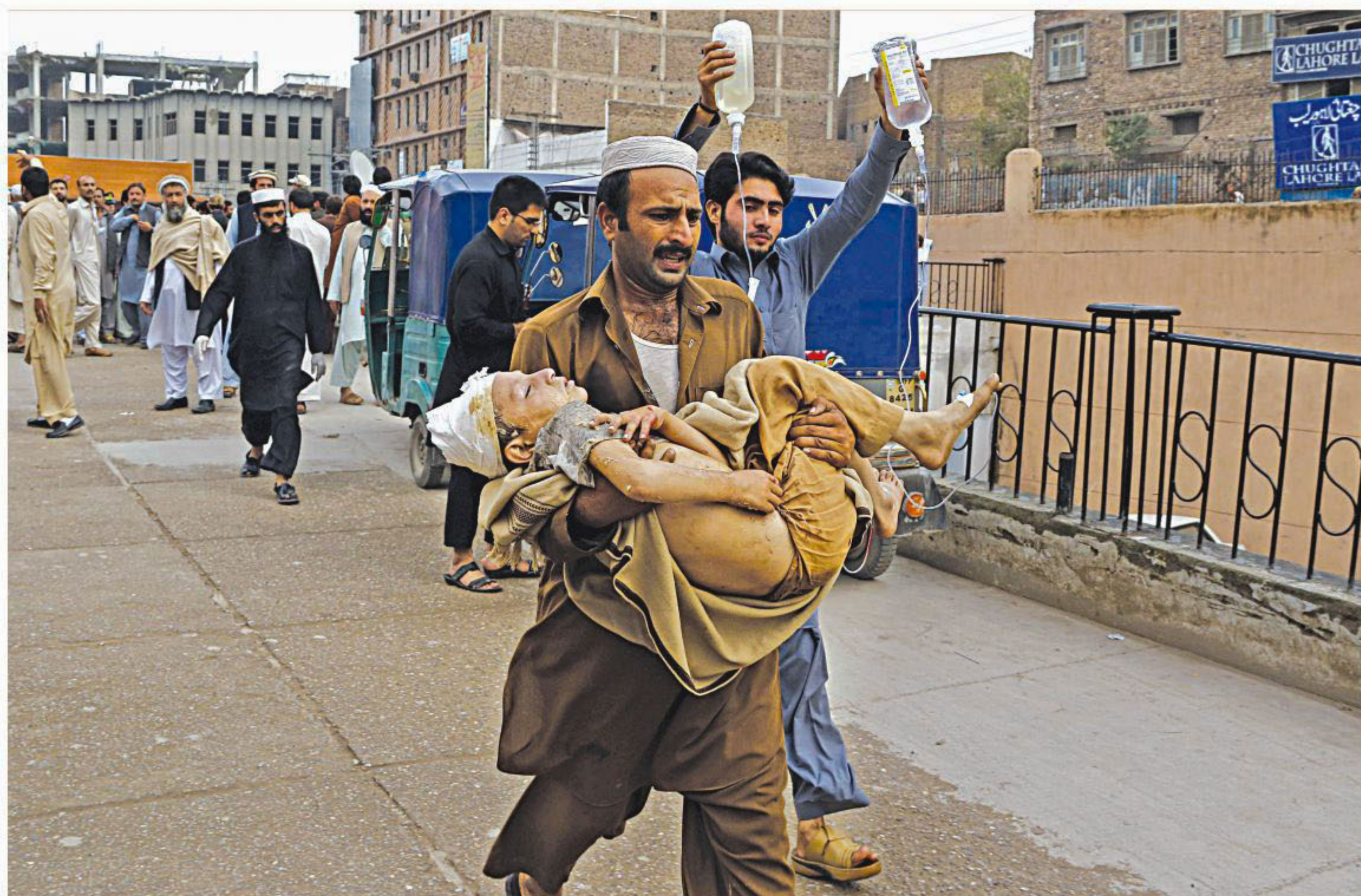
A man carries a boy, who was injured in an earthquake, at the Lady Reading hospital in Pakistan's Peshawar. A powerful earthquake struck a remote area of north-eastern Afghanistan yesterday, shaking the capital Kabul, as shockwaves were felt in northern India and in Pakistan's capital, where hundreds of people ran out of buildings as the ground rolled beneath them.