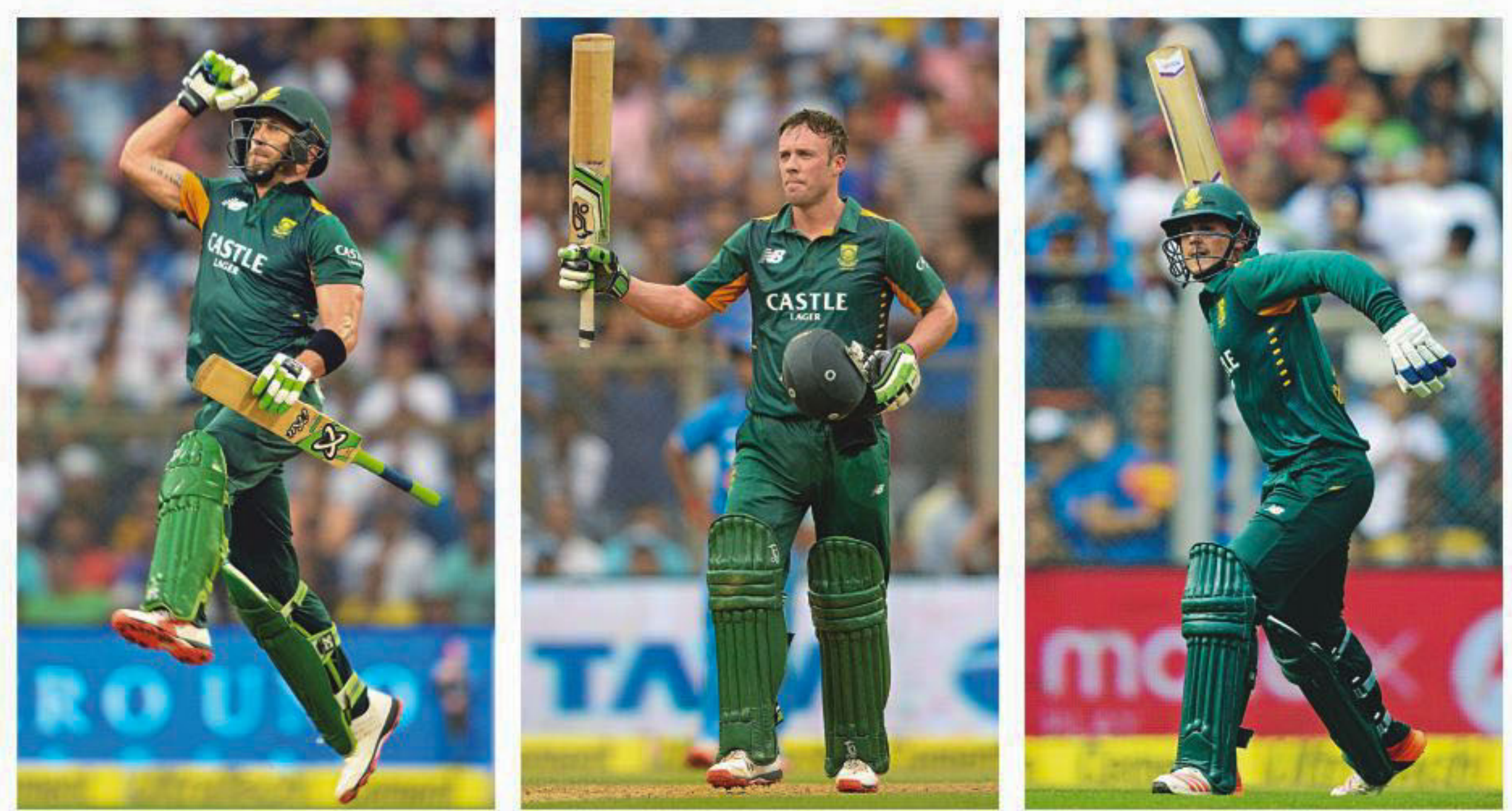
THREE HORSEMEN OF THE APOCALYPSE: India felt the wrath of South Africa's (L-R) Faf du Plessis, AB de Villiers and Quinton de Kock, who all scored centuries in the fifth and decisive ODI in Mumbai yesterday, as the Proteas defeated the hosts by 214 runs.