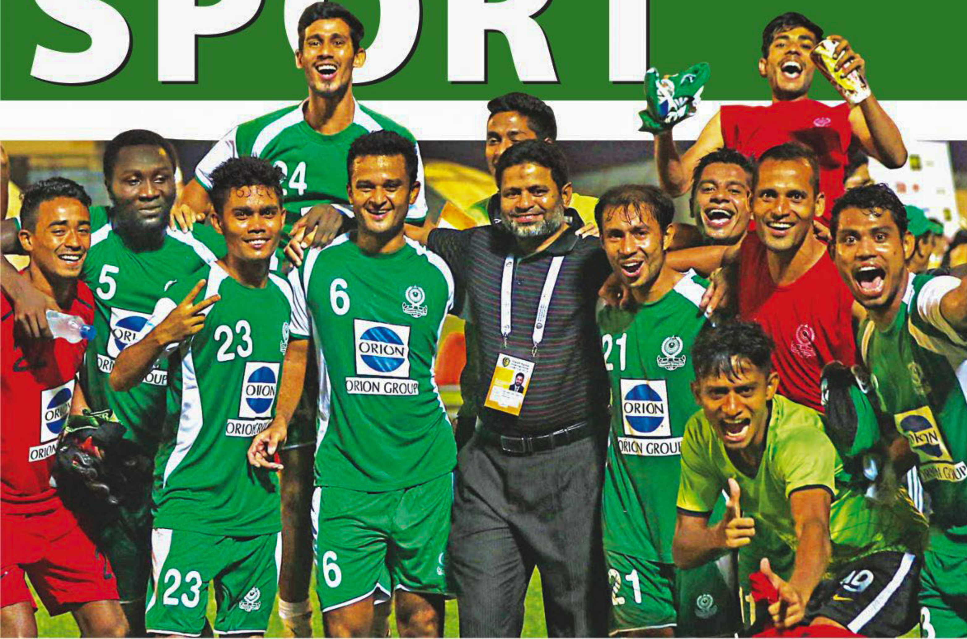
Mohammedan players celebrate a 2-1 victory over their Kolkata namesake, which put them into the semifinals of the Sheikh Kamal International Club Cup, at the MA Aziz Stadium in Chittagong yesterday.