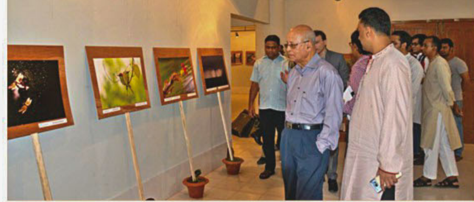
Visitors at the exhibit.