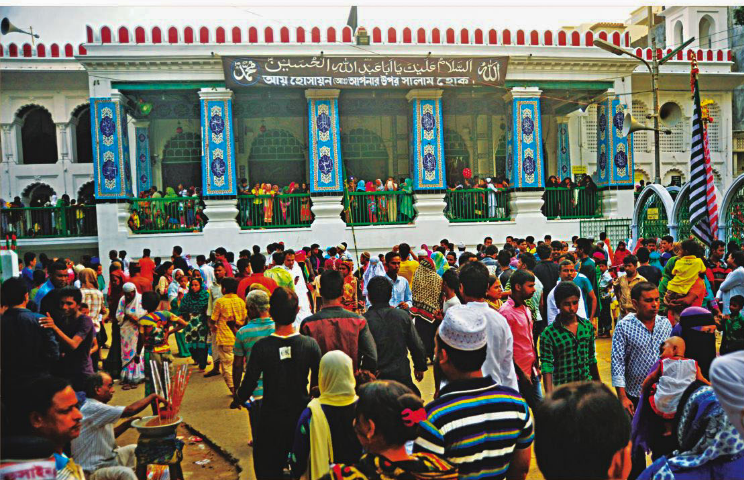
A large number of people of the Shia community gather at the Huseni Dalan in the capital's Bakshi Bazar yesterday hours before the blasts. The mourning procession is organised every year to mark the day of holy Ashura.