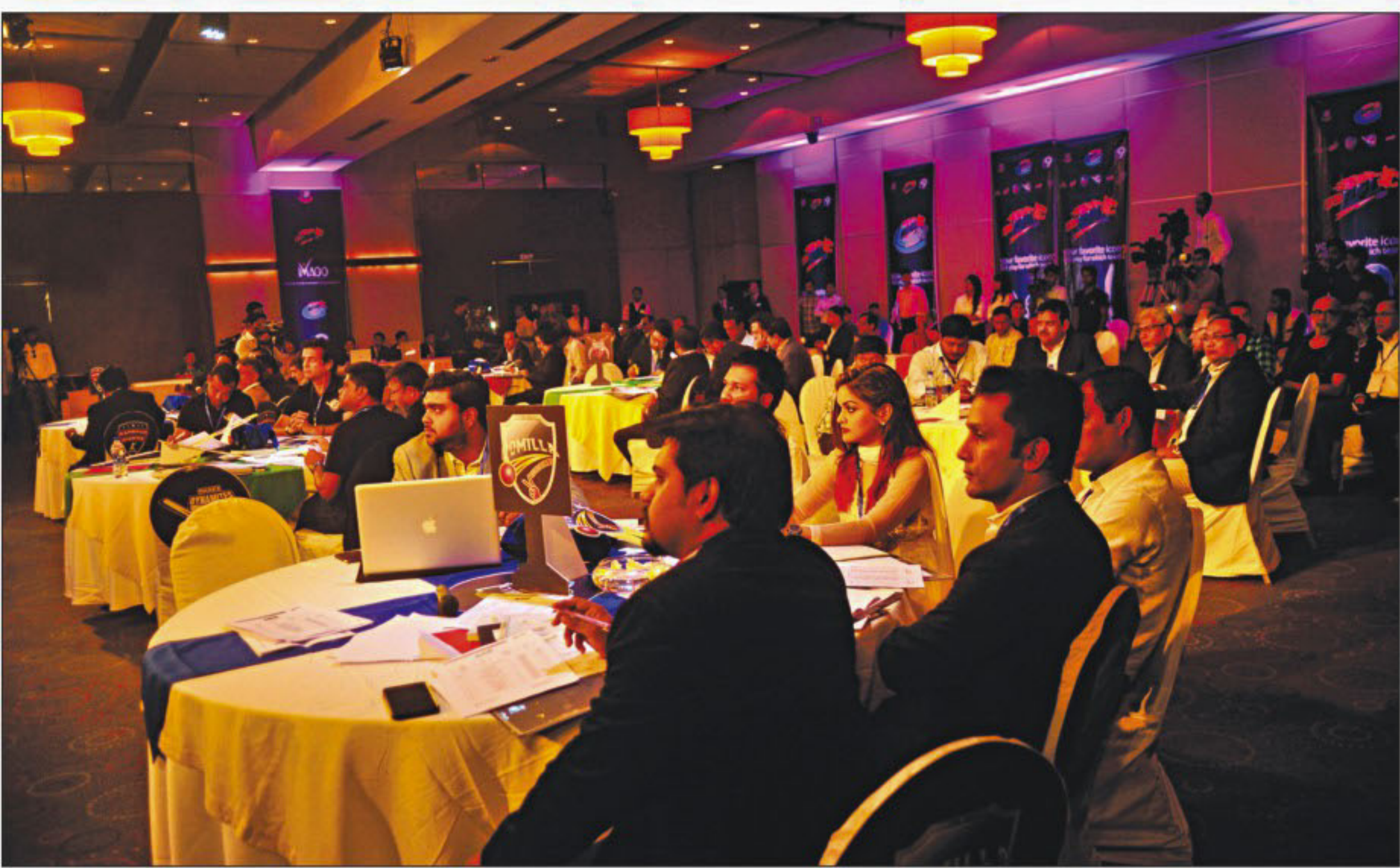
The star-cast of six franchises had a hectic day at the Radisson Blu yesterday, when they entered the players' auction for the third Bangladesh Premier League, a glamorous domestic T20 cricket competition that starts on November 20 after a gap of two years. Story on page 18