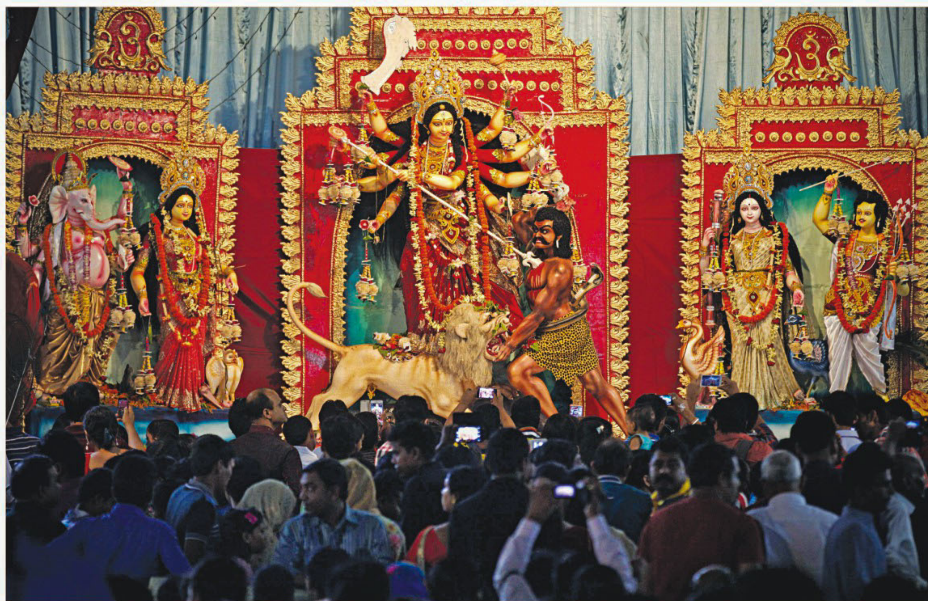
People gather at the historic Dhakeshwari National Temple for one last view of Durga and her children on the last day of Sharadiya Utsav yesterday. Today, Hindus will bid farewell to the Goddess through immersion of her idol.