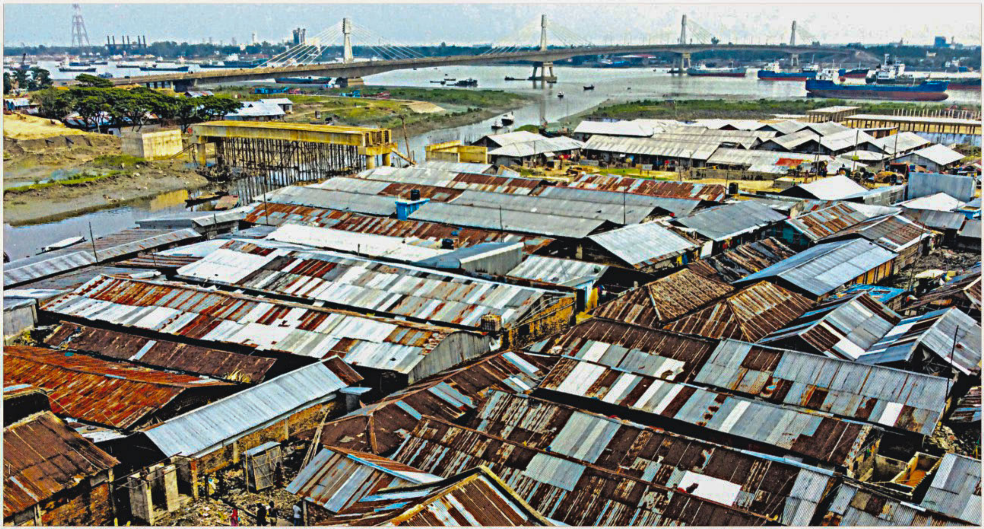
To the north of Third Karnaphuli Bridge, hundreds of shanties have encroached on a part of the river. Raw sewage and garbage from the houses keep polluting the lifeline of Chittagong city. The photo was taken on Monday.

During a visit to Kalurghat and Shah Amanat Bridge areas a week ago, SEE PAGE 2 COL 2