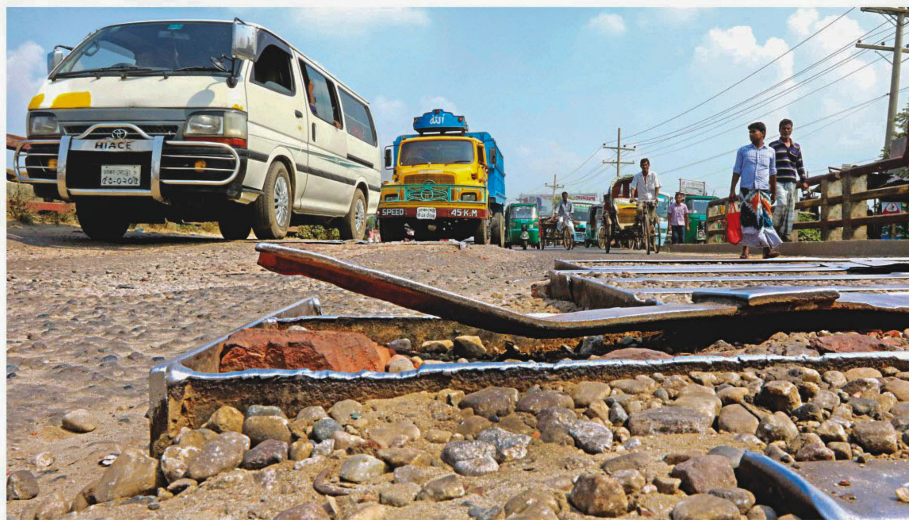
A badly rutted stretch of Golakandail bridge on the Dhaka-Sylhet highway has iron bars sticking out in places. Bottom , an unfit bus, with many dents and a panel of its body missing, carrying passengers in the capital's Rampura and a locally-made, illegal three-wheeler plying the Dhaka-Sylhet highway. All the photos, taken yesterday, demonstrate the abysmal condition of our highways and vehicles plying them with the National Road Safety Day being observed today. Related photo on Page 2.