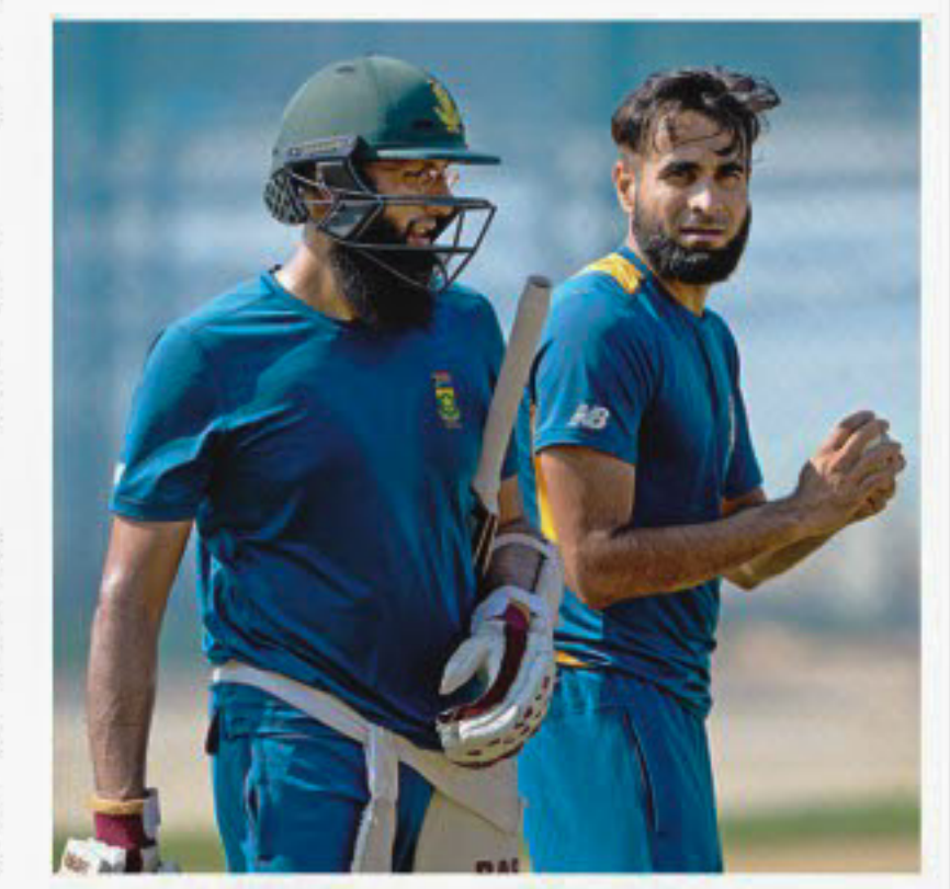
South Africa opener Hashim Amla (L) and their ace spinner Imran Tahir will be hoping that their performances can help South Africa clinch the ODI series against India in the fourth ODI in Chennai today.

The South African pace attack has not been at its very best on the Indian tracks, but Dale Steyn, Morne Morkel and Kagiso Rabada have been effective. Leg-spinner Imran Tahir will lead the Proteas' spin attack.