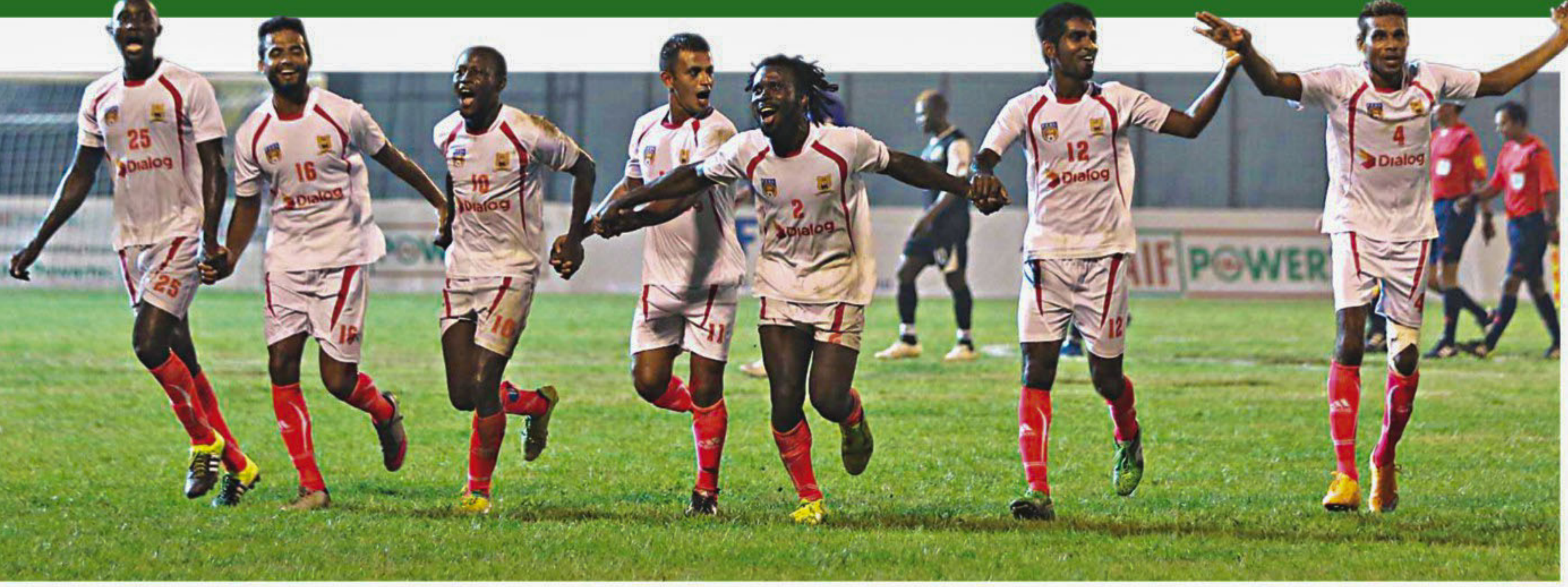
The players of Solid SC get together for a lap of honour after their 2-1 victory over Kolkata Mohammedan in yesterday's first match of the Sheikh Kamal International Club Cup at the MA Aziz Stadium in Chittagong.